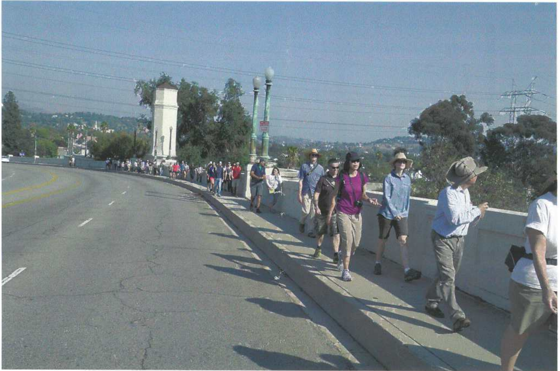
Photo of Hyperion Bridge South sidewalk looking north