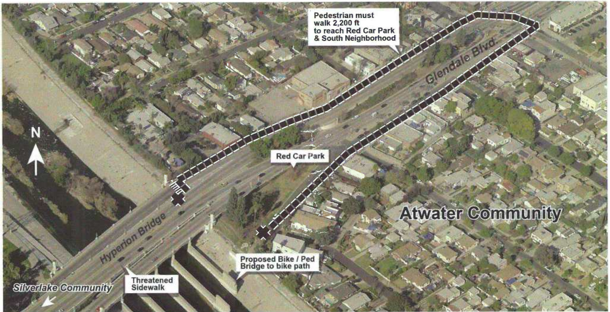
Aerial Photo showing detour required with sidewalk only on north side of bridge