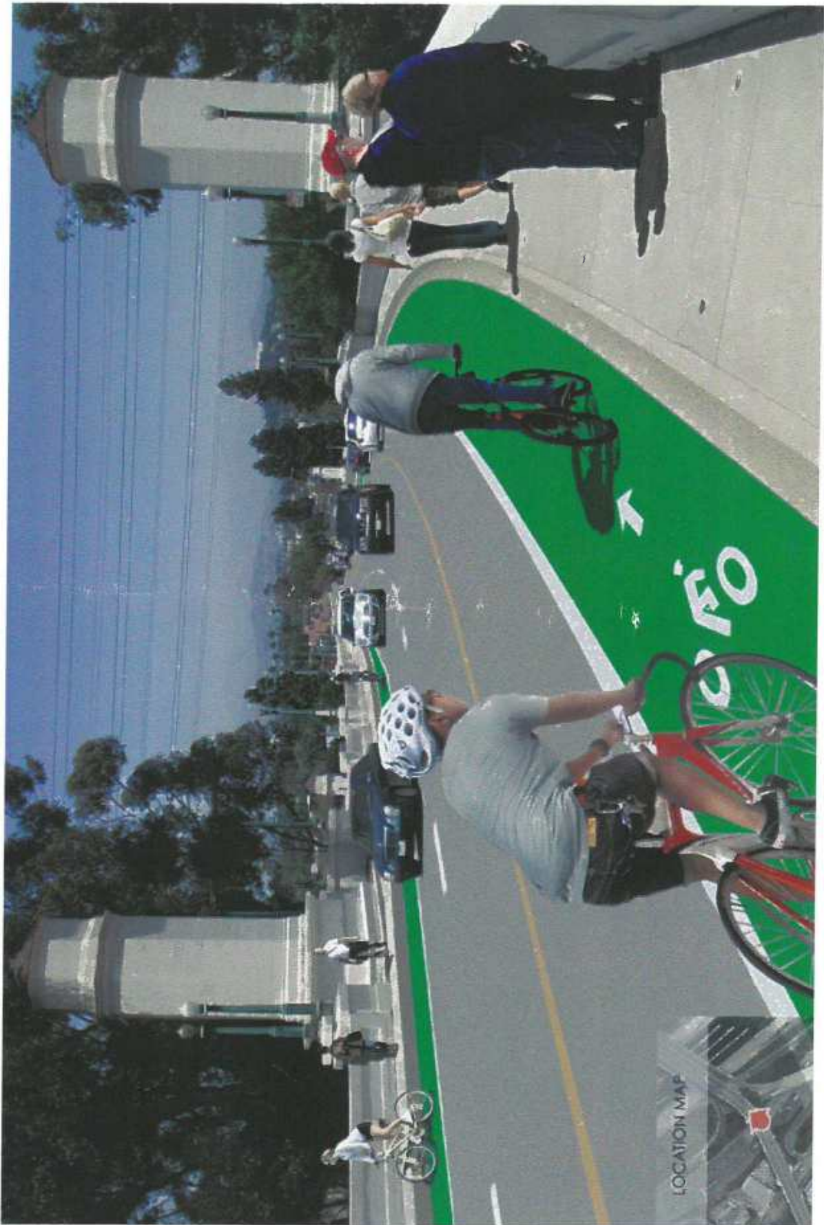
Option 3 Conceptual Design Sketch from Enrich LA