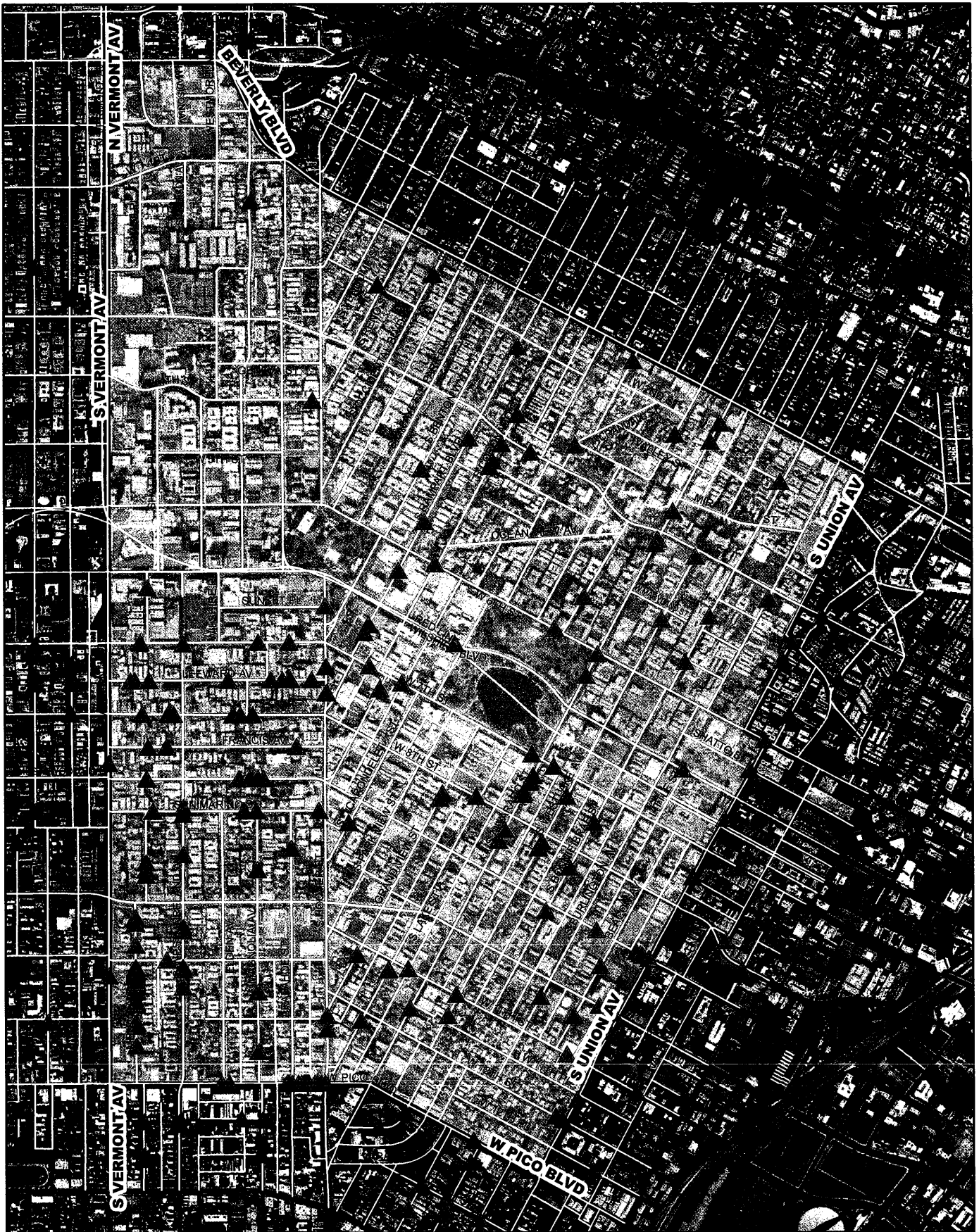
Proposed: Central American Historic District