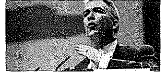
Rep. Joe Walsh: Media protecting 'Occupy Wall Street'