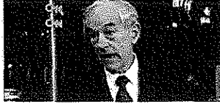
Ron Paul: War on drugs undermines civil liberties