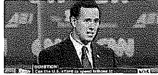
At GOP debate, Santorum claims Africa is a 'country'