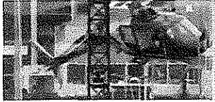
Helicopter crashes while setting up Christmas tree

Featured Video Politics Satire / Parody Activism Whoa!