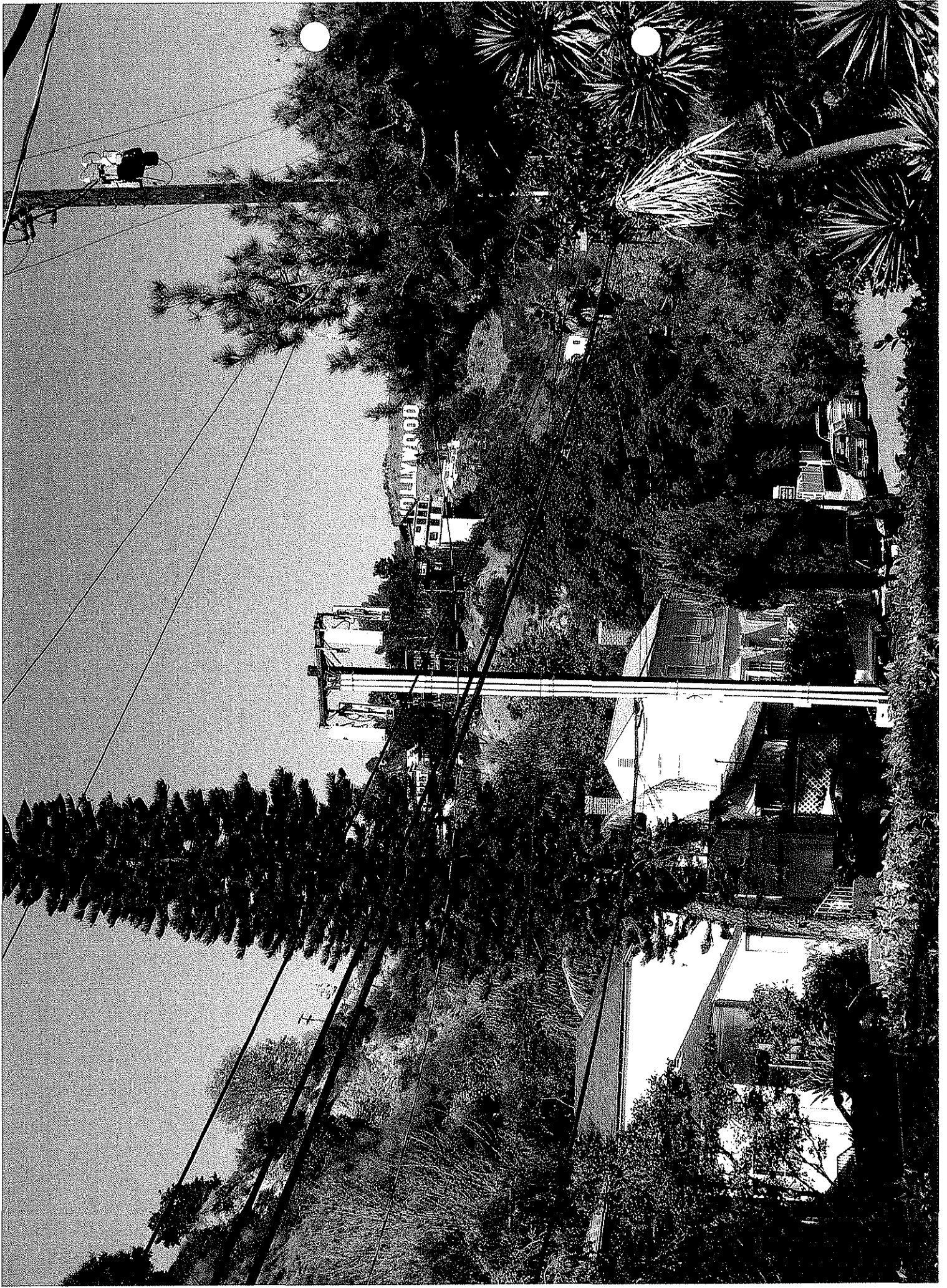
Photo taken in THE OAKS Neighborhood in the Hollywood Hills