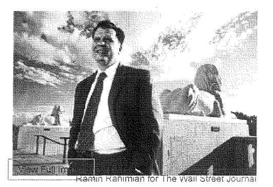
Utah state Sen. Dan Liljenquist pushed his state to move toward a pension plan more similar to those used in the private sector.

State governments, one of the last bastions of guaranteed pensions, are increasingly taking a page from the 401(k) plans that dominate the private sector.