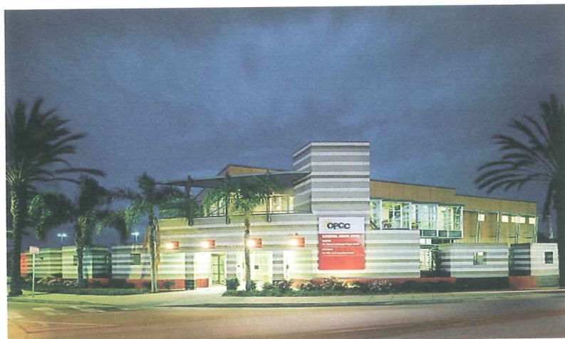
Cloverfield Services Center – Emergency Shelter by OPCC in Santa Monica, CA

Prior to enactment of SB 2, housing element law required local governments to identify zoning to encourage and facilitate the development of emergency shelters. SB 2 strengthened these requirements. Most prominently, housing element law now requires the identification of a zone(s) where emergency shelters are permitted without a conditional use permit or other discretionary action. To address this requirement, a local government may amend an existing zoning district, establish a new zoning district or establish an overlay zone for existing zoning districts. For example, some communities may amend one or more existing commercial zoning districts to allow emergency shelters without discretionary approval. The zone(s) must provide sufficient opportunities for new emergency shelters in the planning period to meet the need identified in the analysis and must in any case accommodate at least one year-round emergency shelter (see more detailed discussion below).