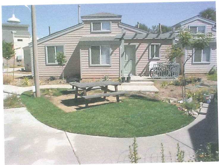
Quinn Cottages, Transitional Housing in Sacramento, CA

If the local government can demonstrate that the multi-jurisdictional agreement can accommodate the jurisdiction's need for emergency shelter, the jurisdiction is authorized to comply with the zoning requirements for emergency shelters by identifying a zone(s) where new emergency shelters are allowed with a conditional use permit.