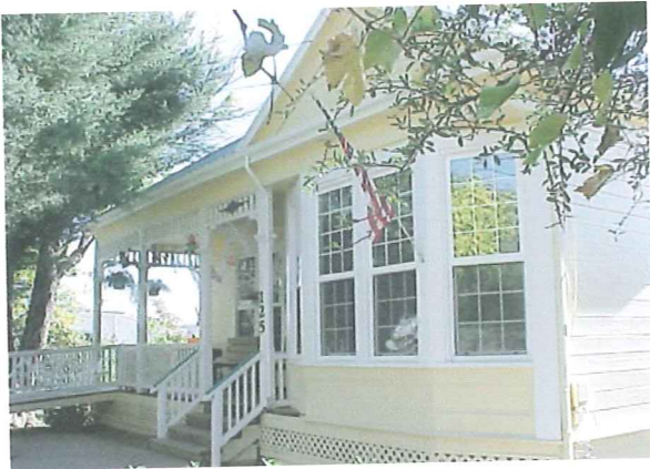
Emergency Shelter – Jackson, California

Requiring a variance, minor use permit, special use permit or any other discretionary process does not constitute a non-discretionary process. However, local governments may apply non-discretionary design review standards.