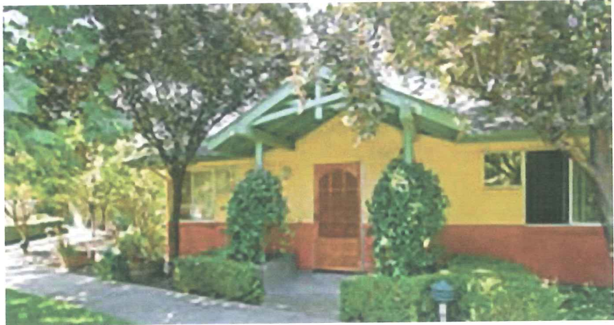
Hendley Circle Apartments – Supportive SRO Housing in Burbank

Many local governments have a record of effective actions to address the homeless needs in their community. SB 2 recognizes and provides flexibility for jurisdictions that have already adopted an ordinance(s) that complies with the new zoning requirements. For those local governments with existing ordinances and zoning consistent with requirements of SB 2, no further action will be required to identify zones available for emergency shelters. The housing element must however, describe how the existing ordinance, policies and standards are consistent with the requirements of SB 2.