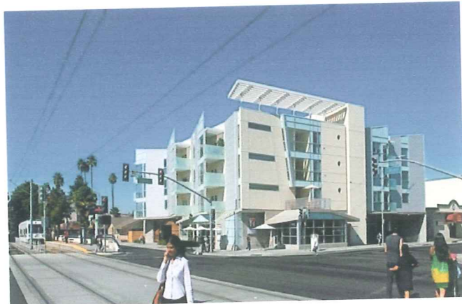
Gish Apartments – Supportive Housing, San Jose, CA

Effective programs reflect the results of the local housing need analyses, identification of available resources, including land and financing, and the mitigation of identified governmental and nongovernmental constraints. Programs consist of specific action steps the locality will take to implement its policies and achieve goals and objectives. Programs must include a specific timeframe for implementation, identify the agencies or officials responsible for implementation, and describe the jurisdiction's specific role in implementation.