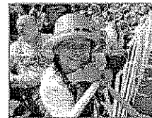
St. Patrick's Day Parade 2012