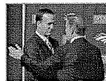
Broncos Introduce Peyton...