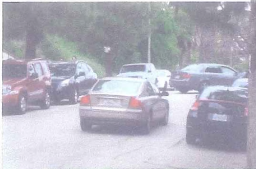
Vendors Block Gates – Fire Vehicle Access?