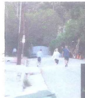
Walking in the Roadway