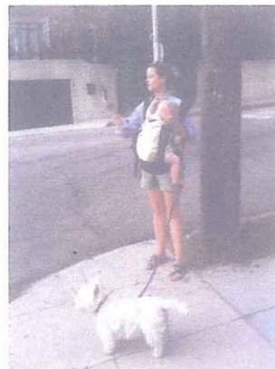
Running Stop Signs