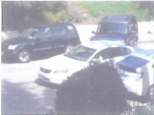
Total Congestion – Blocking Fire Vehicles