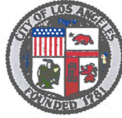
ERIC GARCETTI MAYOR