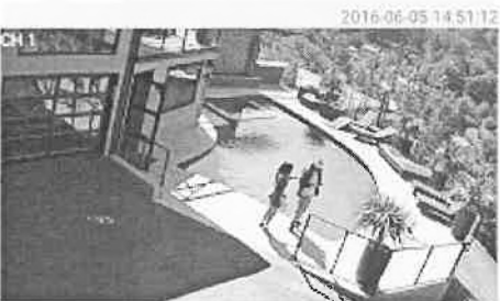
Screenshot_20160606-094351_resized (Medium).png 1034K