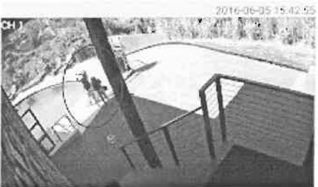
Screenshot_20160606-132759_resized (Medium).png 991K