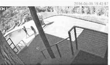
Screenshot_20160606-132814_resized (Medium).png 925K