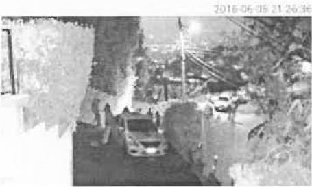
Screenshot_20160606-090722 (Medium).png 846K