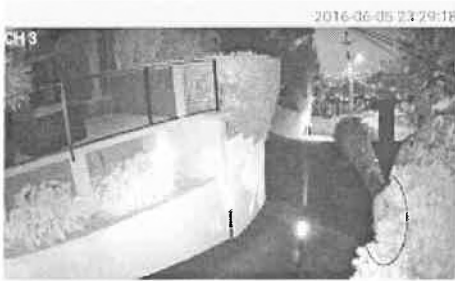
peeing (Medium).png 627K