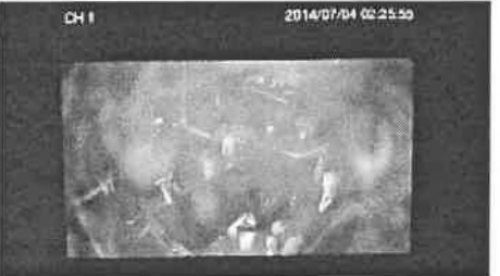
Swing - driveway.jpg 870K