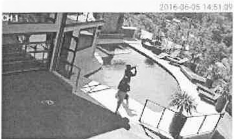
Screenshot_20160606-094456_resized_1 (Medium).png 1010K