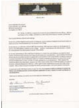
Peru Village Letter 2 CHNC Board 050613.jpg 765K