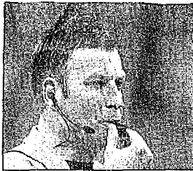
ONLY A GAME Referees have reason to fear for their safety Sports » C1

Today's Web bonus » Sequestration: Everything we know so far. bit.ly/BONUS0508