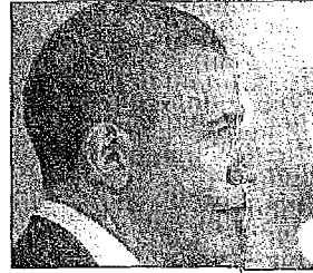
ALLIES MEET Obama: North Korea has failed to drive wedge Nation » World » A10

We've got a brand new car with your name on it!