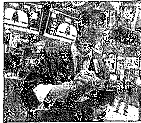
WALL STREET Dow ends above 15,000 for the first time Business » A13