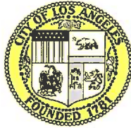
ERIC GARCETTI MAYOR