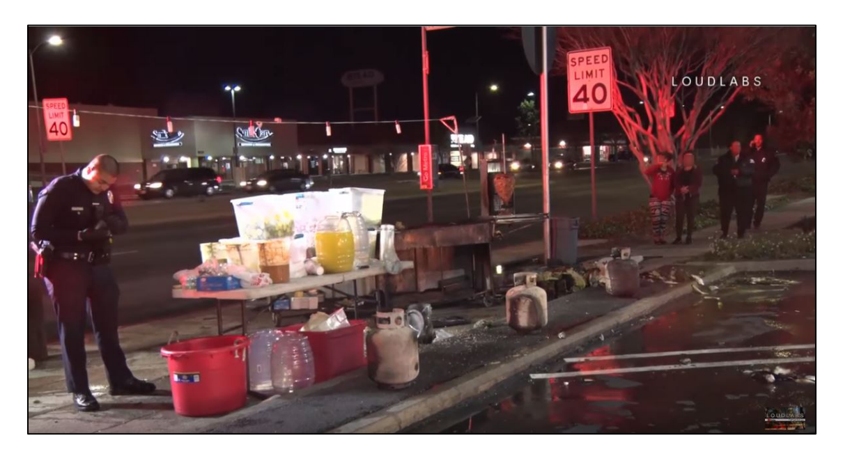
Figure 18. Abandoned and destroyed food ingredients along with 3 visible propane tanks for the operation at Bank of America, 10300 Sepulveda Blvd, Mission Hills, on January 28, 2018. Members of the public and police personnel at site.