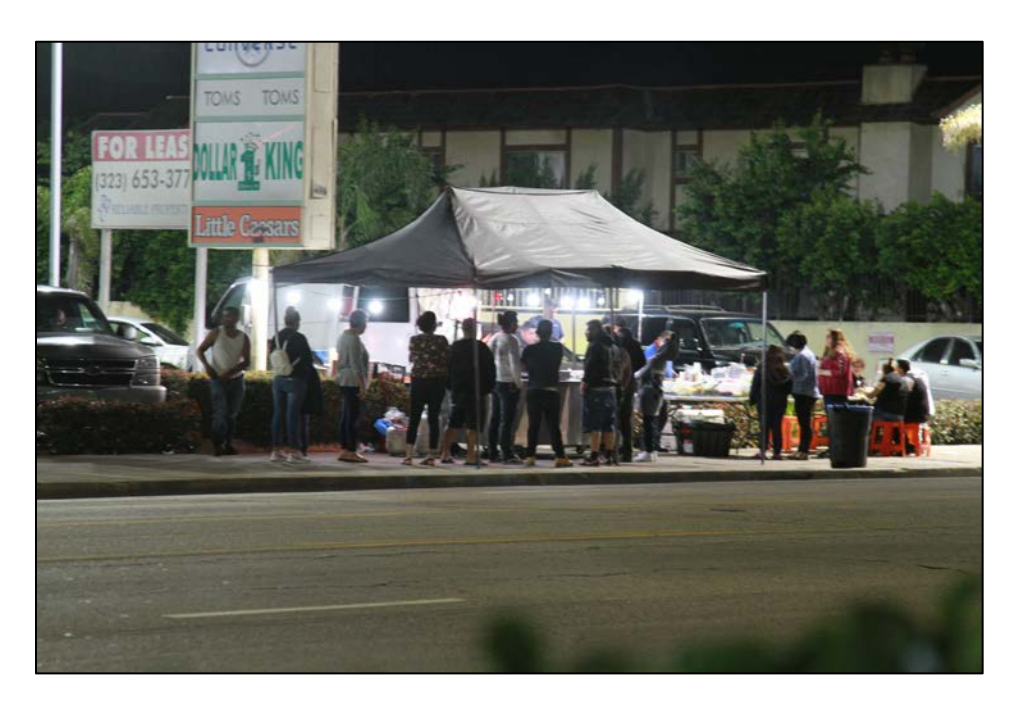
Figure 11. Scene of night time open-flame sidewalk vendor's operations at Little Caesars, 14421 Van Nuys Blvd, Arleta, with multi-family housing evident in the background. Canopy consumes entire width of the sidewalk with clientele and related vendor's equipment impeding the public's right-of way on May 27, 2019 at 8:16 PM.