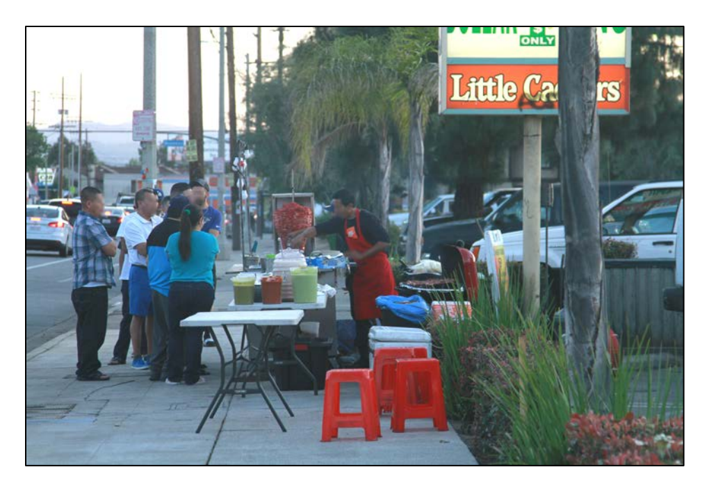
Figure 10. Open-flame grill equipment with vendor personnel not wearing gloves, uncovered condiments, seating, table, exposed meat to automotive exhaust, airborne particulates, pollution, and unknown. Clientele, vendor furniture, and related equipment clearly blocking width of sidewalk rendering it inaccessible for the people in wheelchairs and the general public. On Van Nuys Blvd and Woodman Avenue at Dollar King, 14439 Van Nuys Blvd, Arleta, on April 22, 2019.