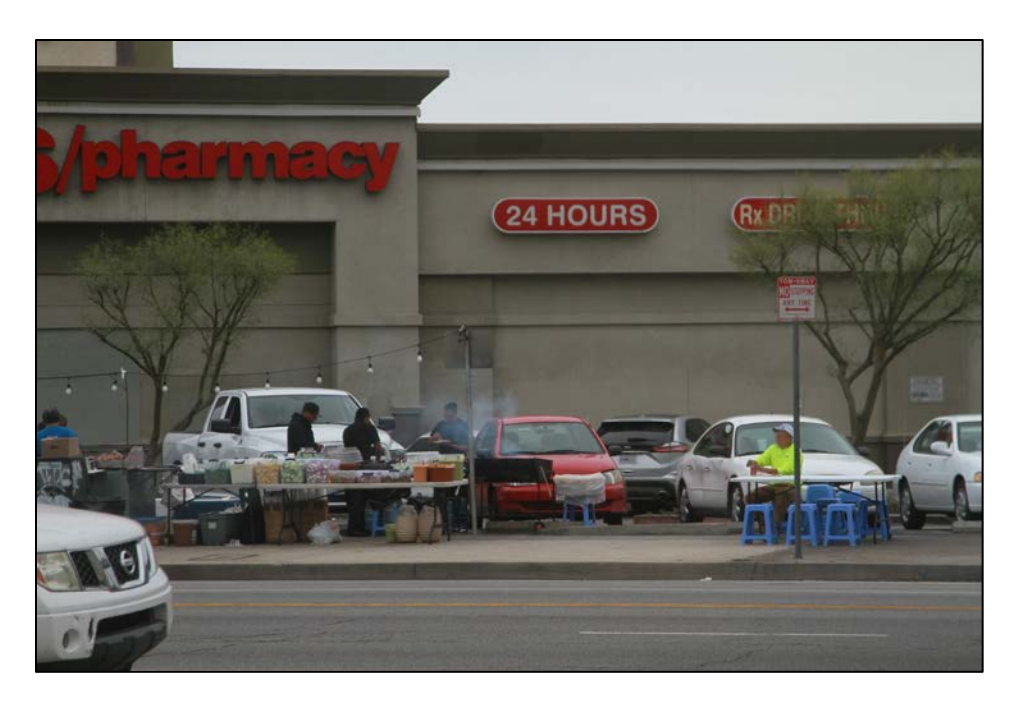
Figure 5. Almost the entire portion of the sidewalk (that is adjacent to commercial land use) is consumed by the open-flame sidewalk vendor. Aside from the two grills and condiment tables an additional table with seating is made available to the clientele where the seating impedes proper access and use of the sidewalk by the general public and particularly people with mobile disabilities. Same vendor shown in Figures 3 and 4 on Nordhoff Street side at CVS Pharmacy, 9089 Woodman Avenue, Arleta, on May 7, 2019, at 6:17 PM.