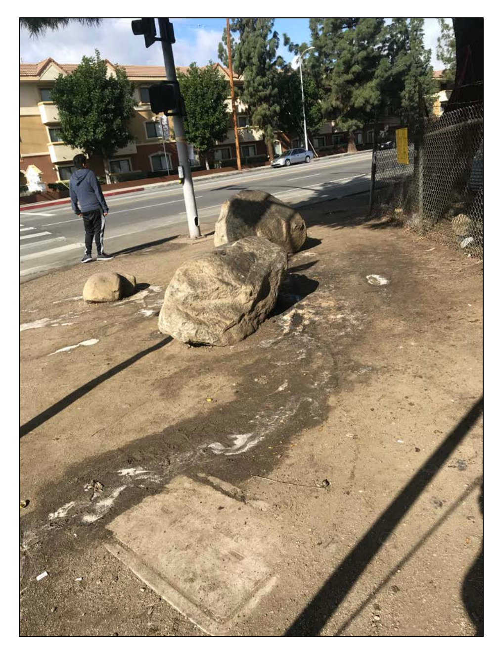
Figure 15. Grease was dumped directly onto the soil at unpaved path at Woodman Avenue/Filmore Street in Arleta. White film build up is the dried up grease plus unknown chemicals that accompanied the grill's residues. Circa Spring 2018, morning picture.