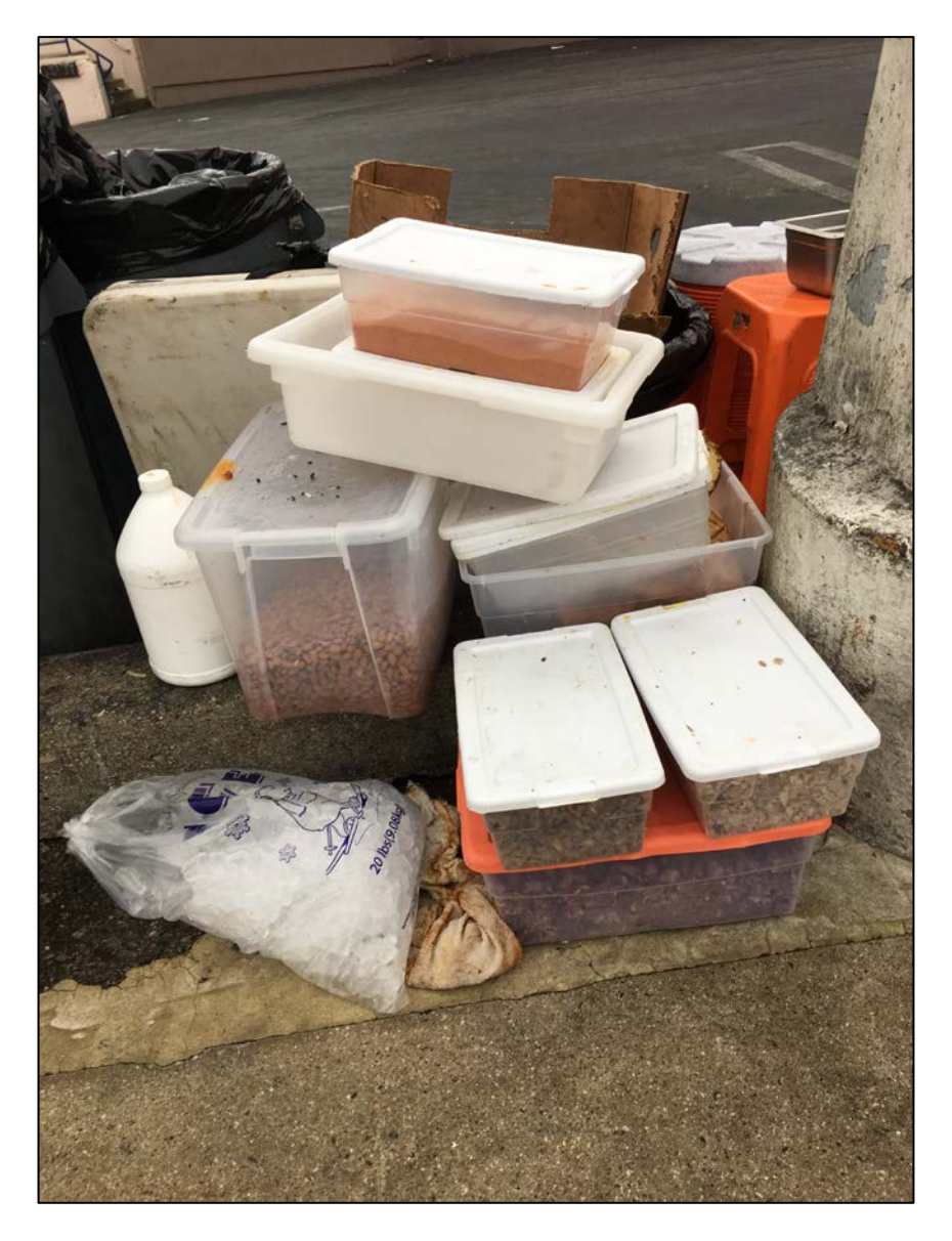
Figure 9. Close-up photo of abandoned bins filled with condiments, ingredients, a bag of ice, and related furniture/equipment from the open-flame sidewalk vendor at 99 Cent Store, 8625 Woodman Avenue, Arleta, on Woodman Av side at Chase Street on May 9, 2019, approximately 4:30 PM.