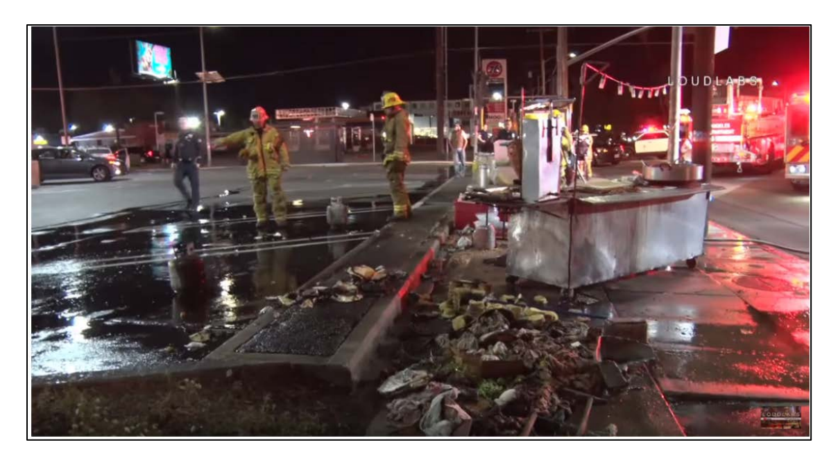
Figure 16. Sidewalk food vendor's propane tank explosion and both police and fire personnel to control the situation. Propane tank visible on the parking lot in front of fireman wearing the yellow helmet. Sidewalk food vendor operators nowhere to be seen at Bank of America, 10300 Sepulveda Blvd, Mission Hills on January 28, 2018.