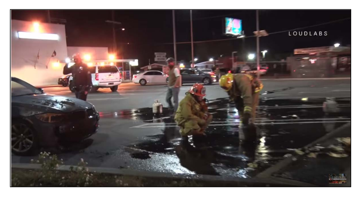
Figure 19. Damaged vehicle at Bank of America, 10300 Sepulveda Blvd, Mission Hills, as a result of propane tank explosion on January 28, 2018.