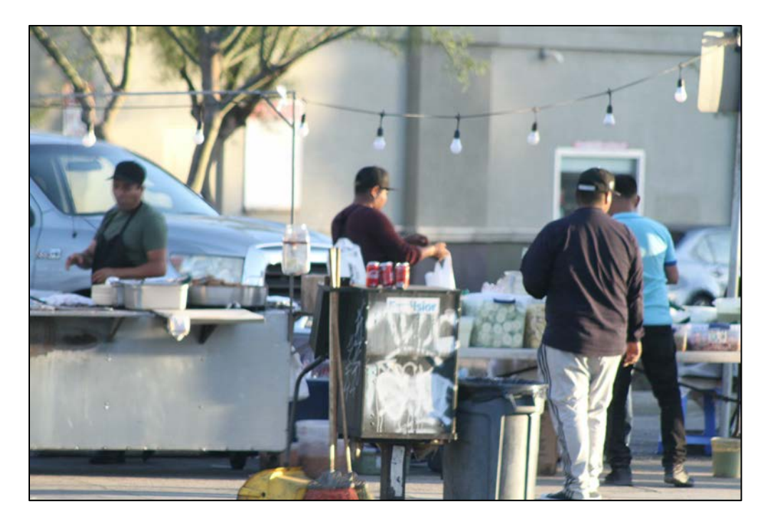
Figure 1. Food handlers are not wearing gloves and subject their own clientele to potential E. coli infections or worse. On Nordhoff Street side of the CVS Pharmacy at 9089 Woodman Avenue, Arleta, on April 22, 2019 at 6:55 PM.