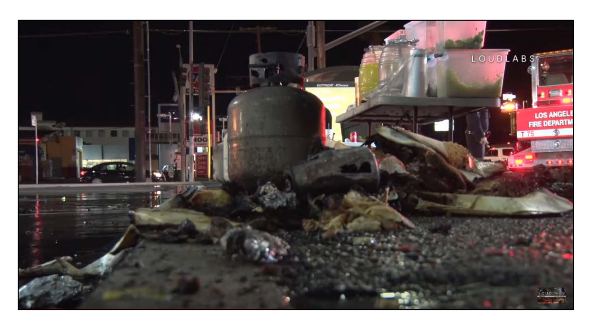
Figure 17. Close up of propane tank and abandoned table of condiments and related trash and debris after fire and its eventual extinguish. Sidewalk food vendor operators nowhere to be seen at Bank of America, at 10300 Sepulveda Blvd, Mission Hills, on January 28, 2018.