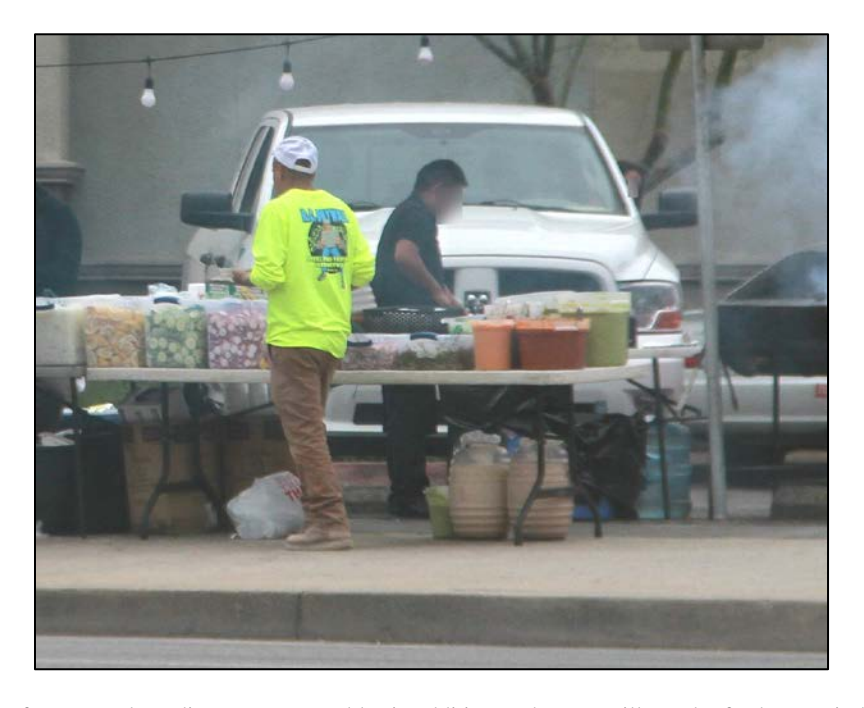
Figure 4. Close up of uncovered condiments on two tables in addition to the two grills, and refreshments in large jugs, 5-gallon water bottle, as well as guacamole in pail sitting on sidewalk underneath condiment table. Same vendor shown in Figure 3 on Nordhoff Street side on at CVS Pharmacy, 9089 Woodman Avenue, Arleta, on May 7, 2019, at 6:17 PM. While not shown in this photograph the open-flame sidewalk vending operation is also adjacent to single-family residences nearby.