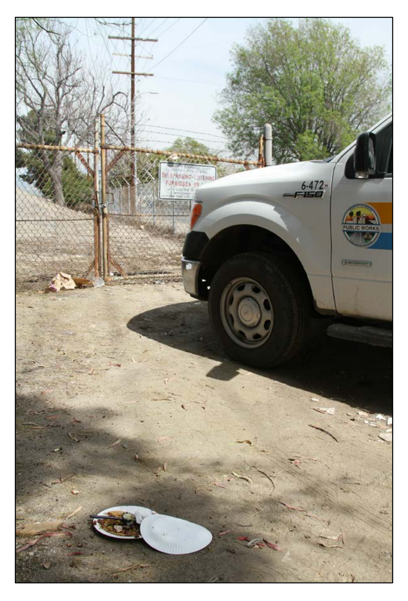
Figure 14. Los Angeles County Public Works vehicle at entrance gate to the Pacoima Spreading Grounds with visible sidewalk food vendor plate left behind by clientele on unpaved dirt path. Food vendor was still setting up near this location at the time of this photograph, March 17, 2017, mid-afternoon picture. Filmore Street side near Gullo Avenue in Arleta.