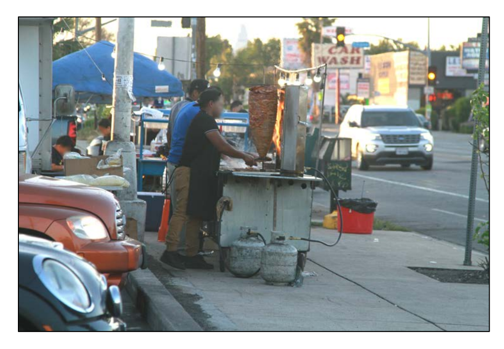
Figure 7. Open-flame sidewalk vendor with meat exposed to automotive exhaust, airborne contaminants, and pollution. Double propane tanks on sidewalk and violation of public's right-of-way for members of the public on wheelchairs or other personal mobility equipment. All three food vendor personnel are not wearing gloves and subject their own clientele to potential E. coli bacteria or worse. Vendor's blue canopy is visible in the background and consumes more sidewalk space. At 99 Cent Store at 8625 Woodman Avenue, Arleta, on the Woodman Av side at Chase Street and Woodman Avenue on April 22, 7:04 PM.