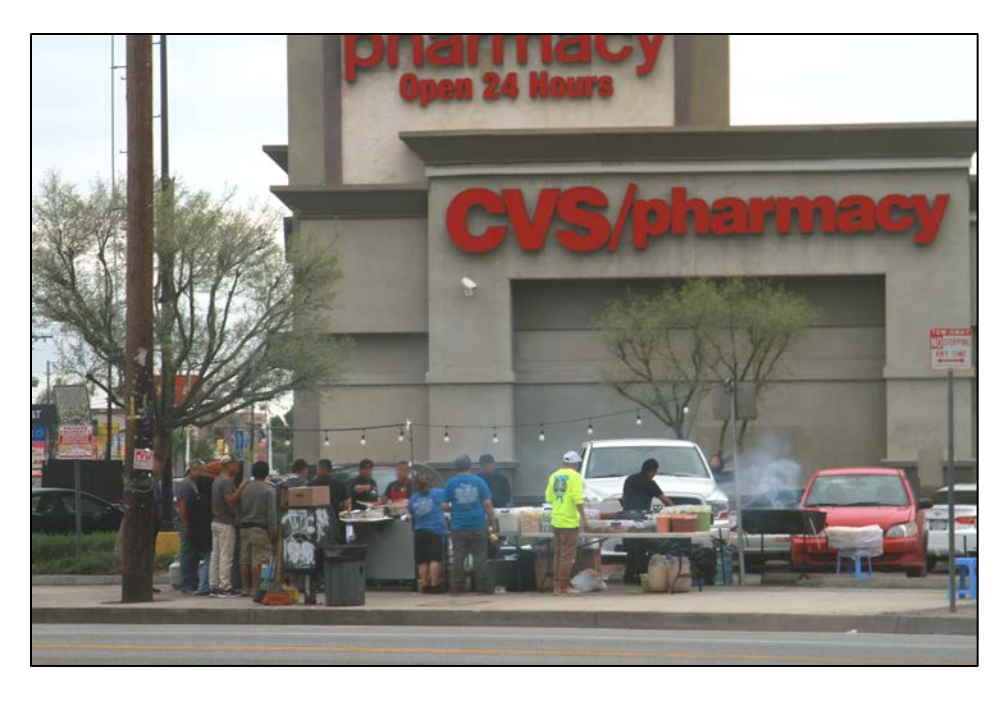
Figure 3. Uncovered condiments on a table without proper temperature conservation of them plus the entire vending scene along with lights for night time operation readiness (which requires a gas-powered generator in this case) and both the open flame grill and clientele clearly blocking the public's right-of-way on the sidewalk and visible smoke from a secondary grill at CVS Pharmacy at 9089 Woodman Avenue, Arleta, on Nordhoff Street side on May 7, 2019 at 6:17 PM.