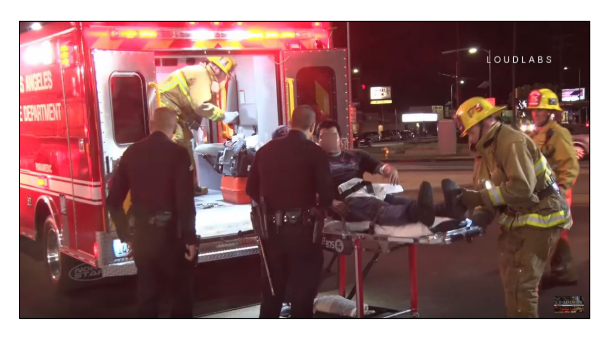
Figure 20. Injury to person as a result of propane tank explosion at Bank of America, 10300 Sepulveda Blvd, Mission Hills, on January 28, 2018.