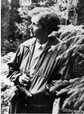
Rachel Carson's Silent Spring imagined a polluted world devoid of birdsong and natural sounds.

How Griffith Park neighbors can help put an end to the pesticide poisoning of wildlife