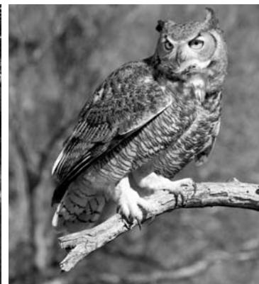
Photos: Bobcat and coyote, Griffith Park Wildlife Connectivity Study; Grey fox, Laurel Klein; all others Friends of Griffith Park.