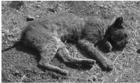
This healthy bobcat tagged in Griffith Park was later found weak and dying from notoedric mange contracted as a result of eating prey that had consumed anticoagulant rodenticide.