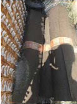
Supplies in backyard3.JPG 3000K