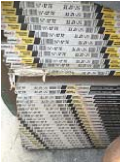
More Supplies in back yard.JPG 3073K