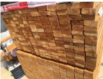
Supplies in back yard.JPG 3876K