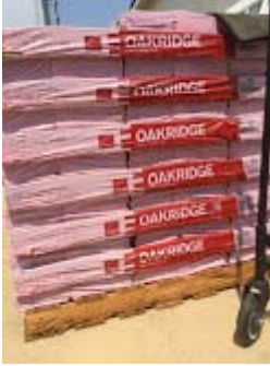
Supplies in back yard2.JPG 2500K