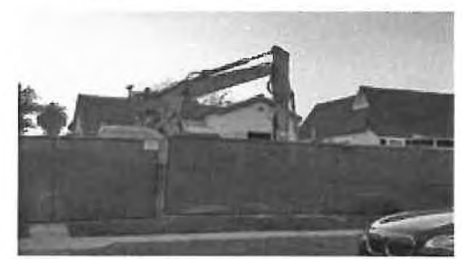
Pending Demolition in Faircrest Heights.jpeg 21K

Faircrest Heights Mansionization Example Pointview.pdf