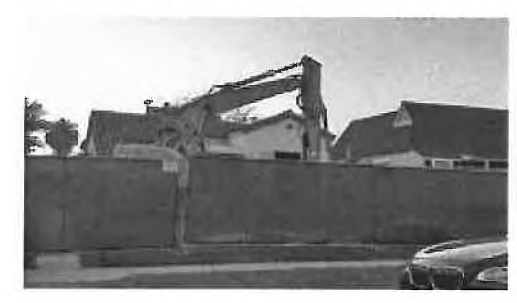
Pending Demolition in Faircrest Heights.jpg 75K

Faircrest Heights Mansionization Example Pointview.pdf 584K