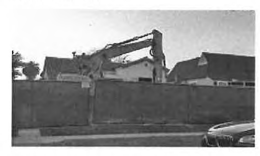
Pending Demolition in Faircrest Heights.jpg 75K

Faircrest Heights Mansionization Example Pointview.pdf 584K