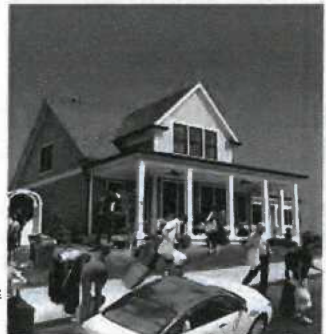
Sunday Airbnb checkout in neighborhoods all across Los Angeles.

For more information visit airbnbwatch.org