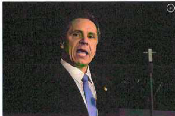
Gov. Cuomo, who had until Oct. 29 to sign or veto the bill, faced immense pressure from those on both sides of the issue.