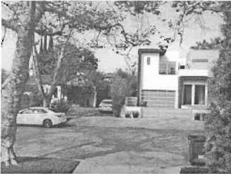
317 s. mansfield front of property (left) showing adjacent northern property (right) IMG_0660.jpg 2140K