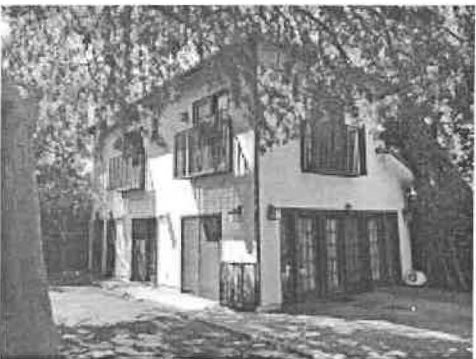
317 s. mansfield full view of ADU facing north west IMG_6860.jpg 3430K