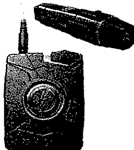
Figure 2: Axon Flex

In June 2014, the SCI officers began the 90-day field test of the Coban solution. Each officer wore the VieVu camera ( See fig. 3 for an example of a VieVu camera ),