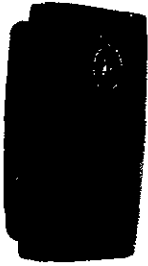
Figure 3: VieVu L3

connected the camera to a computer on the LAPD Local Area Network (LAN) to download the video to the Department's on premise storage solution, and accessed the Coban video management software to review video as required by the draft policy that was published for purposes of the field test. At the end of the 90-day field test of the Coban solution, the VieVu cameras were collected from the SCI officers.