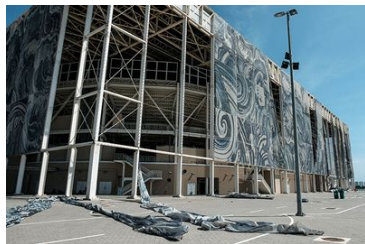
Rio's Olympic Aquatic Stadium in disrepair.

The decision by the Hungarian capital came after thousands signed a petition urging local authorities not to pursue what would be a multibillion-dollar project. Perhaps mindful of the wastelands that now mark sites of previous games, local politicians and bid leaders met and backed down. Having just two cities in the running for one of sport's two landmark events -- the soccer World Cup is the other -- isn't a good look for the IOC.