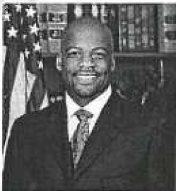
SENATOR ISADORE HALL, III

NOMINATIONS: FEB 29 TH AWARDS: SAT. APRIL 9 TH