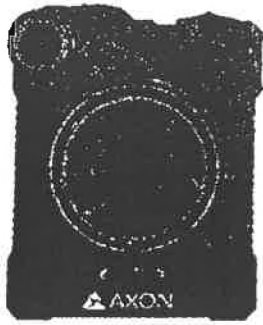
Figure 1: Axon Body 2 Camera