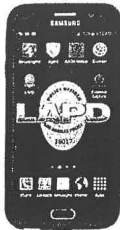
Figure 2: Sprint/Samsung Mobile Device