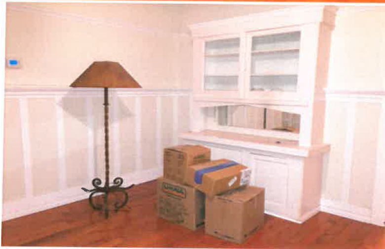
Dining room built-in floor-to-ceiling breakfront at north wall, bat and board with baseboard & plate rail; original wood floor, at 4513 Russell Avenue, photographed June 2015.