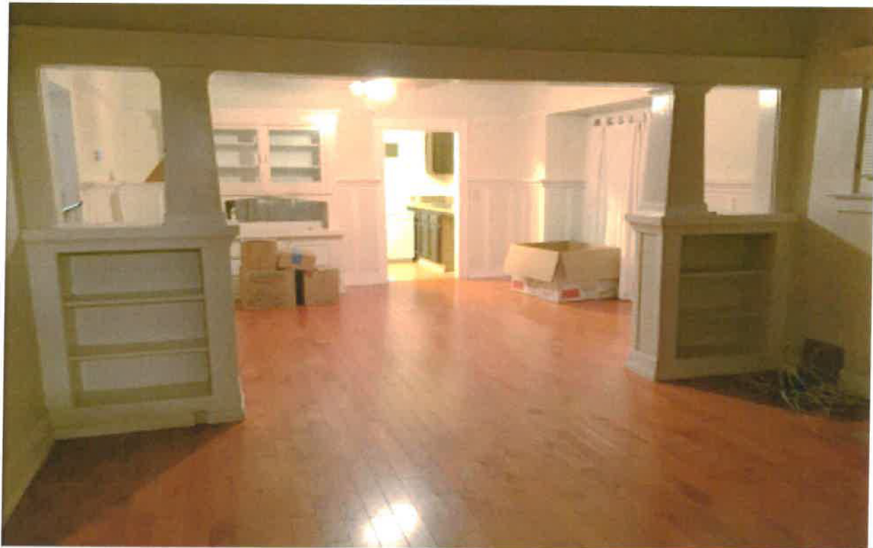
Photos above and below show Craftsman interior details of front house