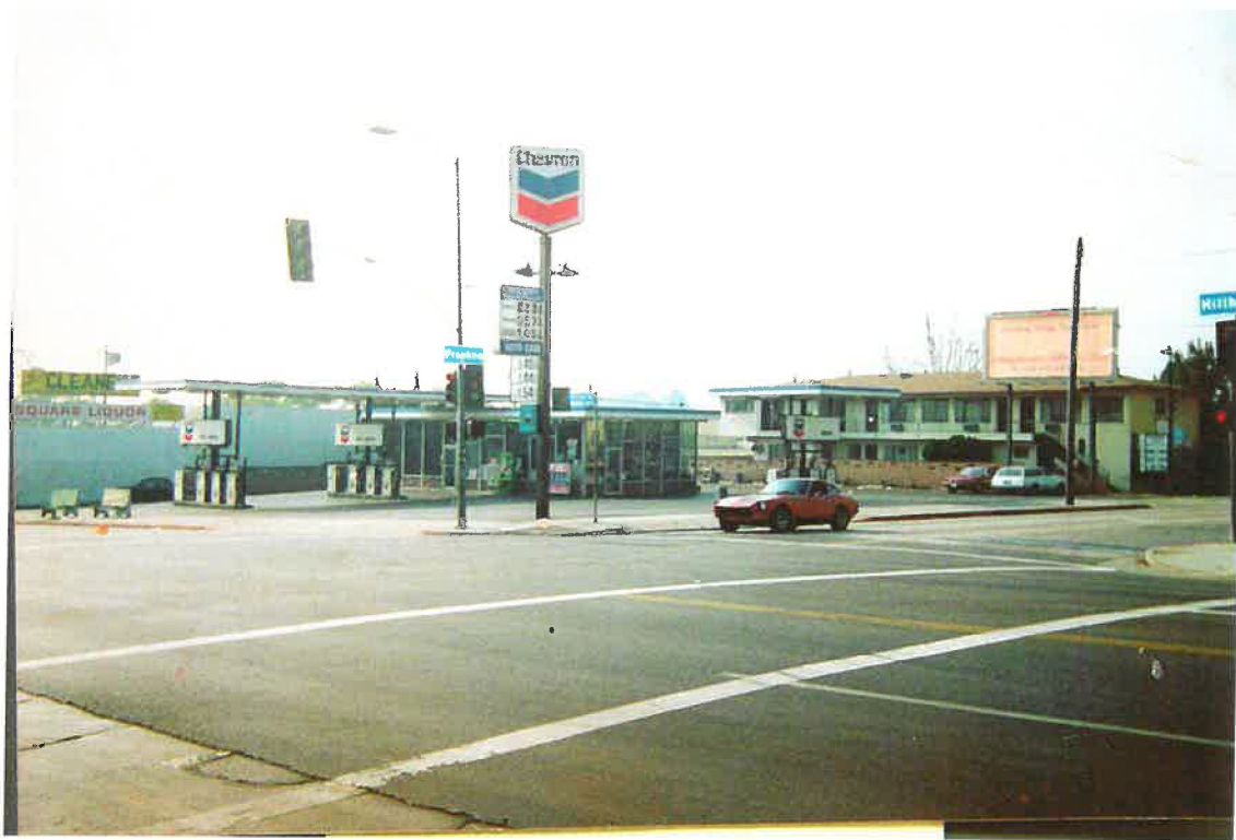
Image dated from 1978 showing a gas station at the southwest corner of Hillhurst and Franklin, directly behind the proposed project