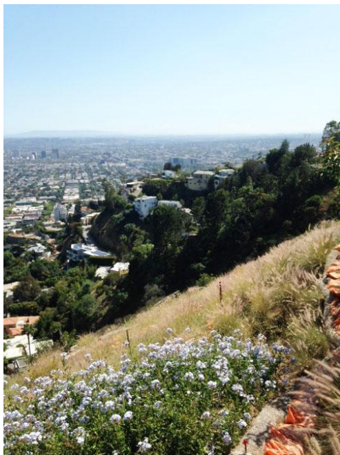
The hillside at Crisler Way has a 70% slope

Laurel Canyon has many paper streets and the neighborhood deserves to be informed of such impacts that will affect their access for long periods of time. The motion was initialed from the Crisler Way road improvement (B permit - BD-401611), which has expired. The 2004 approval for this B permit needs to be redesigned to include codes changes since 2004 and all related infrastructure. Below is a photo of the location of Crisler Way proposed road improvement, photo taken from Grand View at start of Crisler Way.