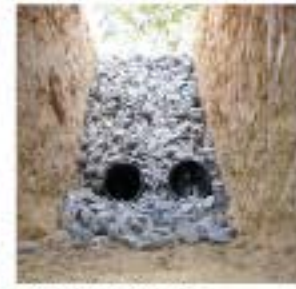
PERMEABLE DRAIN PIPE