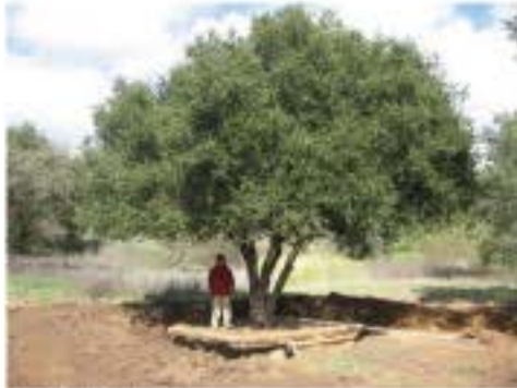
COAST LIVE OAK Quercus agrifolia