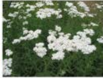
YARROW Achillea millefolium