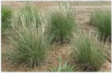
DEER GRASS Muhlenbergia rigens