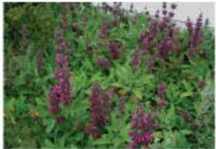
HUMMINGBIRD SAGE Salvia spathacea