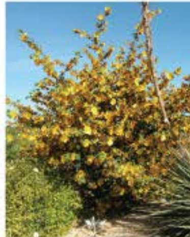
FLANNEL BUSH Fremontodendron californicum