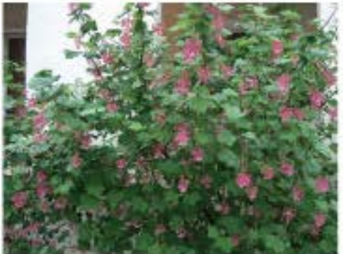
PINK FLOWERING CURRANT Ribes s. 'Spring Showers'