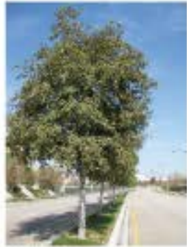
WHITE ALDER Alnus rhombifolia