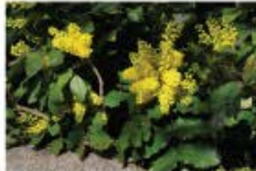
DWARF OREGON GRAPE Berberis a. 'Compact'