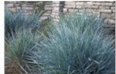
CANYON PRINCE WILD RYE Leymus c. 'Canyon Prince'