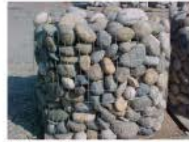
YOSEMITE RIVER ROCK