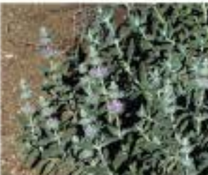
PURPLE SAGE Salvia leucophylla