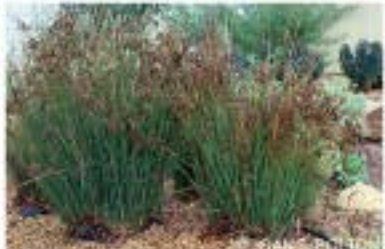
WIRE GRASS Juncus patens