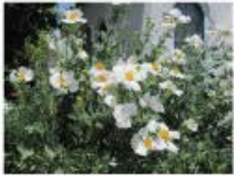
MATILJA POPPY Ronneya coulteri