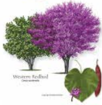
WESTERN REDBUD Cercis occidentalis