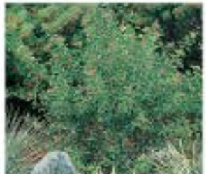
SUGAR BUSH Rhus ovata