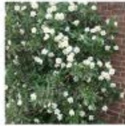
BUSH ANEMONE Capsella californica