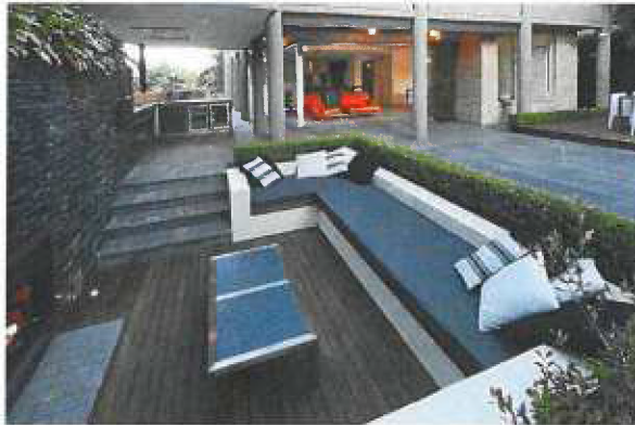
Are open space areas below grade not allowed?

g. Sec. C.1.b. "Any common open space areas shall be located at grade level..." Does this preclude open space sunken patios?