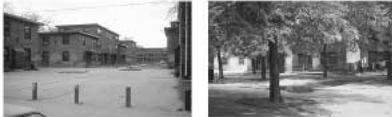
Figure 1: Ground Level View at Ida B. Wells Showing Apartment Buildings With Varying Amounts of Tree and Grass Cover

leaving some areas completely barren, others with small trees or some grass, and still others with mature high-canopy trees (see Figure 1). Because shrubs were relatively rare, vegetation at Ida B. Wells was essentially the amount of tree and grass cover around each building.