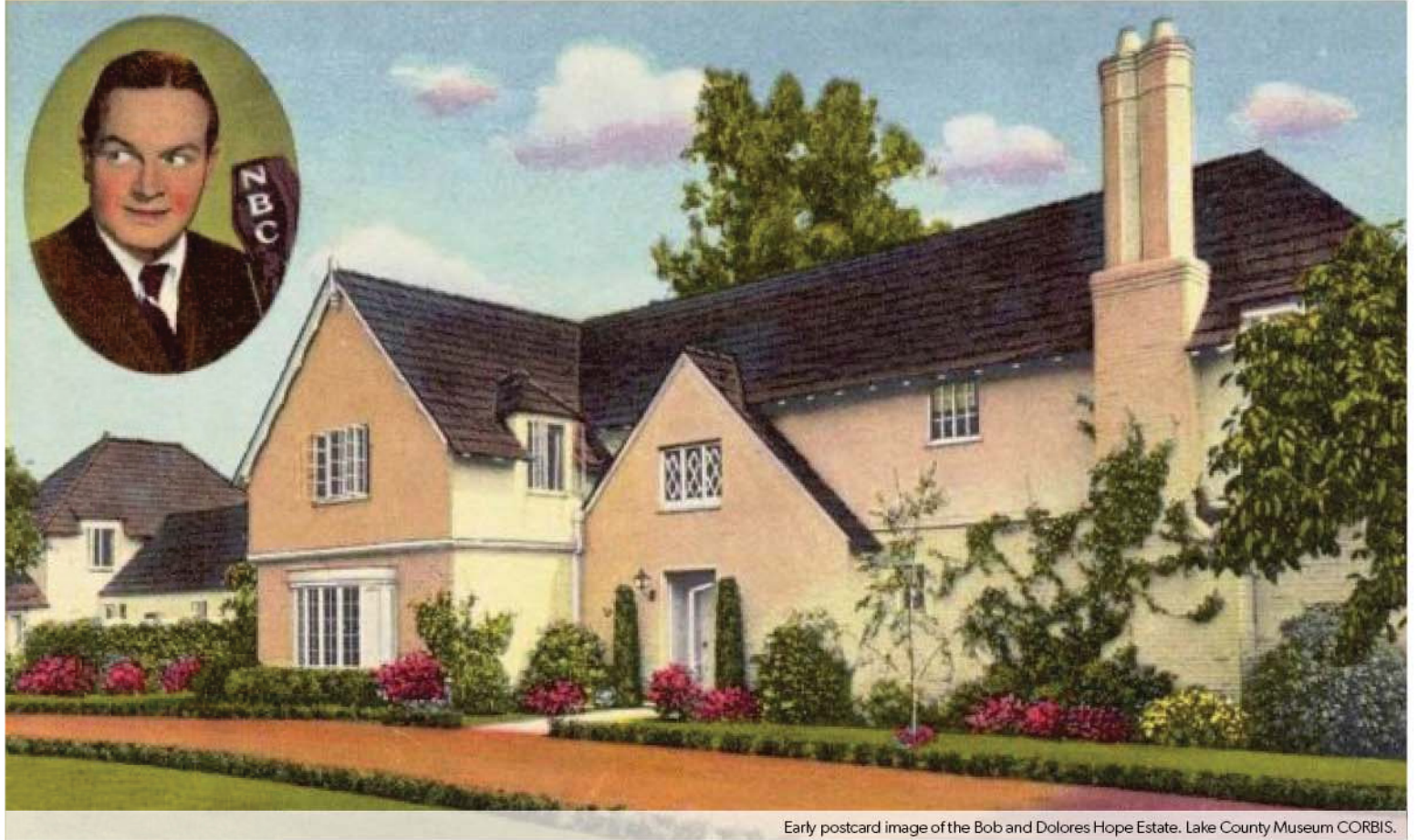
Early postcard image of the Bob and Dolores Hope Estate.