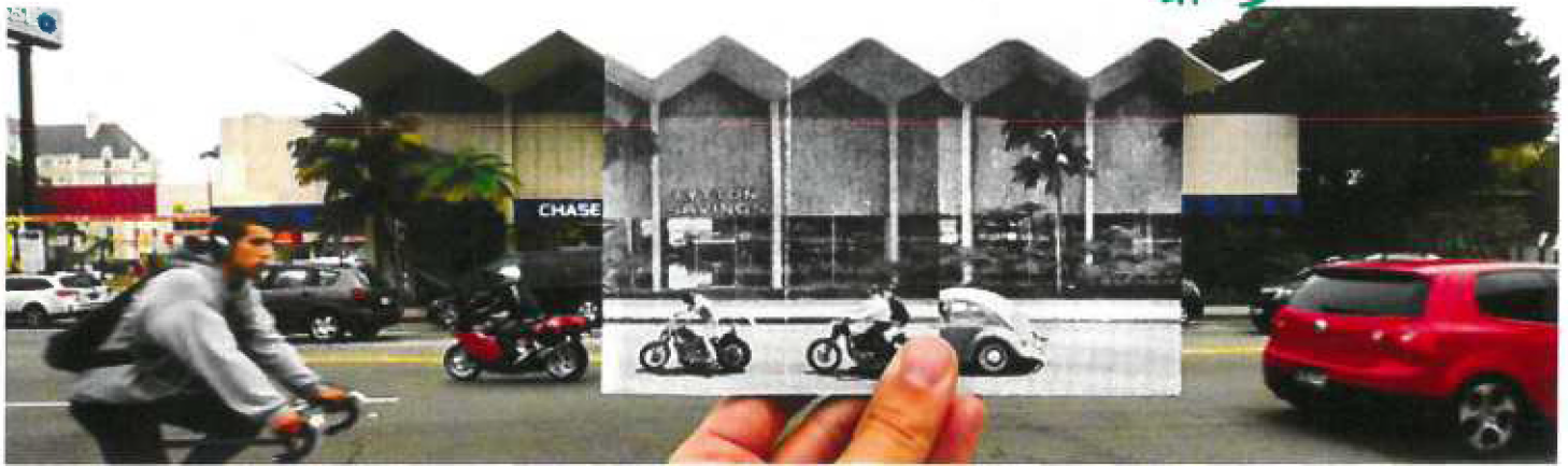
Lytton Savings, inset photo by renowned Los Angeles artist Ed Ruscha in 1966. From the May 2015 issue of Los Angeles Magazine.