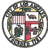
ERIC GARCETTI MAYOR