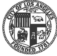
ERIC GARCETTI MAYOR