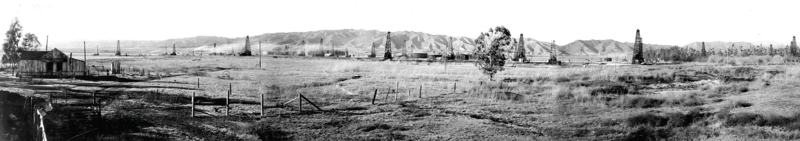
View across Salt Lake oil field to the Santa Monica Mountains from Rancho La Brea. January 26, 1906.

DonGautier L.L.C. has completed an initial evaluation of the petroleum potential of existing oil fields within the City of Los Angeles and concluded that about 1.6 billion barrels of additional oil could be produced using existing technology. At the same time, California imports more than 1 million barrels of crude oil each day, largely by tanker through the ports of Los Angeles and Long Beach.