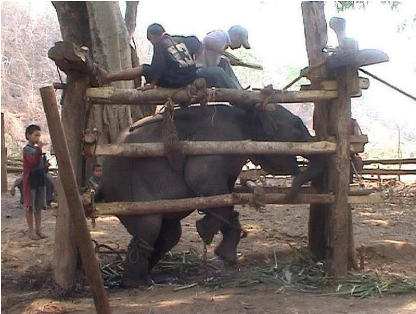
Los safaris de elefantes como éste en un campamento de elefantes tailandeses son