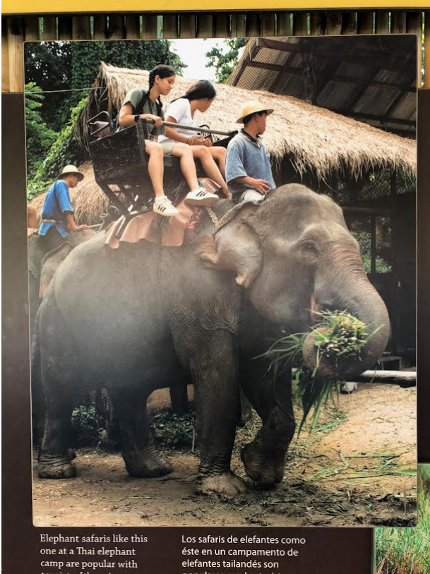
Elephant safaris like this one at a Thai elephant camp are popular with