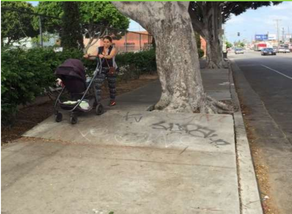
Before at Venice Blvd. and Magnolia Ave.