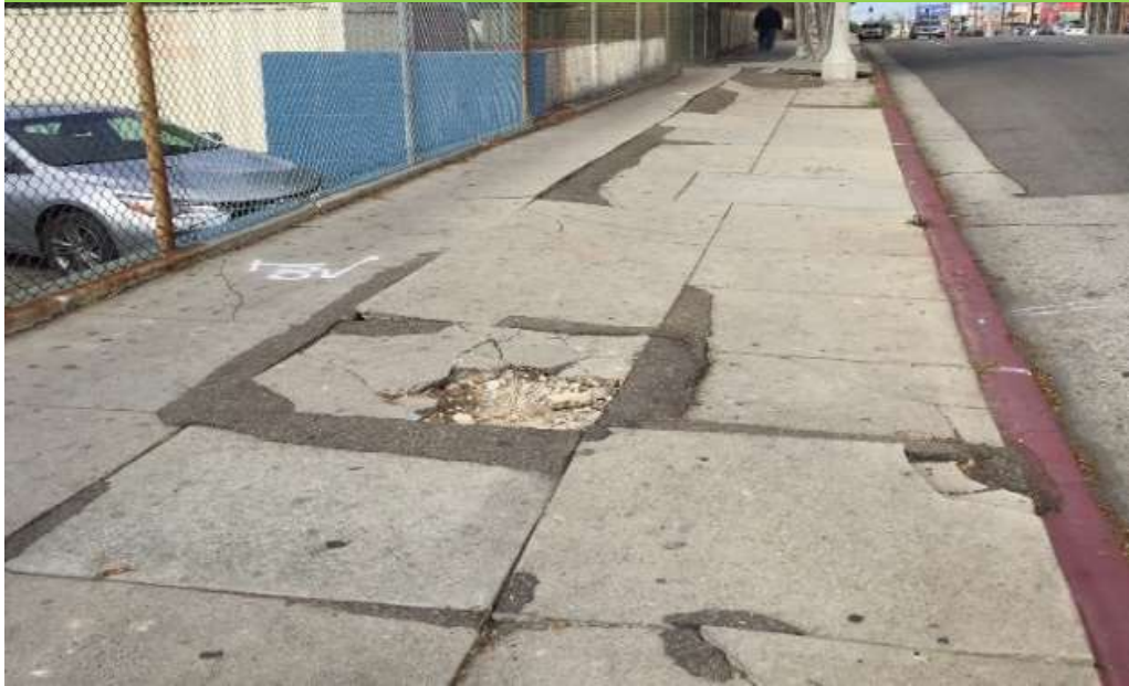
Before at Venice Blvd. and Magnolia Ave.