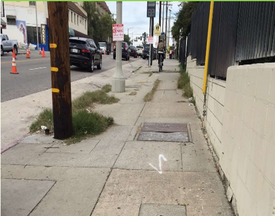
Before at Temple Blvd. and Firmin St.