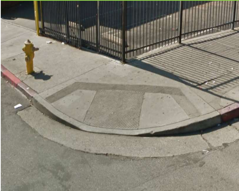
Before at Venice Blvd. and Arapahoe St.