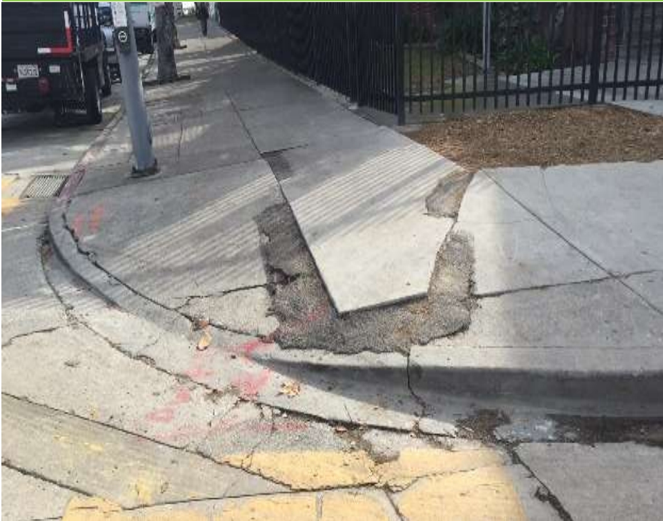
Before at Temple Blvd. and Douglas St.