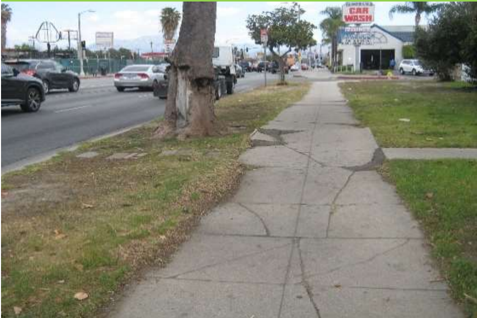
Before at Roscoe Blvd. and Mammoth Ave.