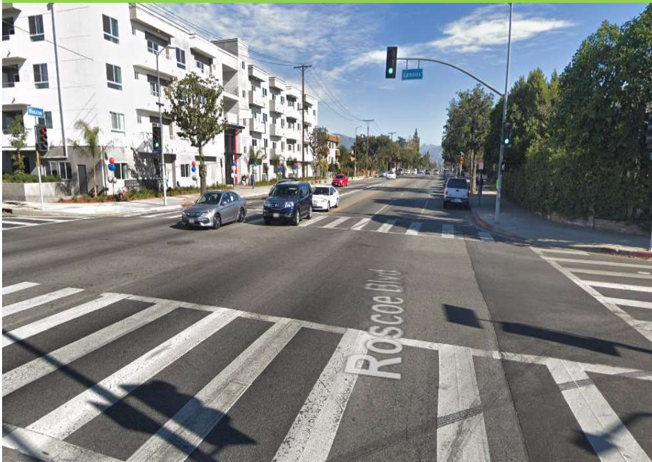
Before at Roscoe Blvd. and Lennox Ave.