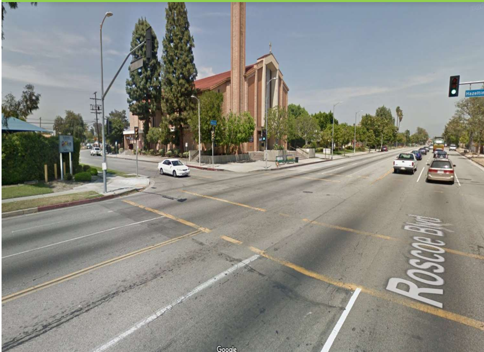
Before at Roscoe Blvd. and Hazeltine Ave.