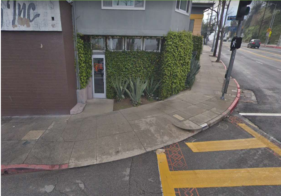
Before at Temple Blvd. and Hoover St.