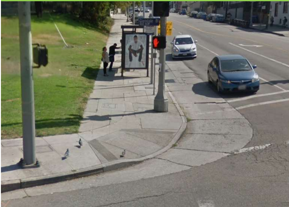
Before at Temple Blvd. and Glendale Blvd.