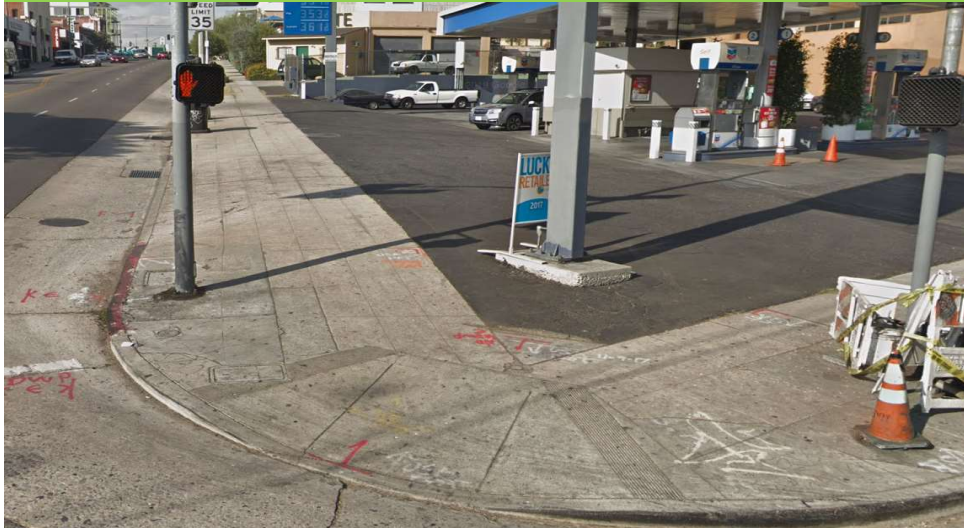
Before at Temple Blvd. and Glendale Blvd.