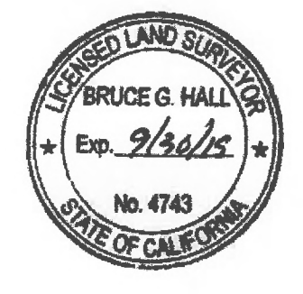
BRUCE HALL LS 4743

BRUCE HALL LAND SURVEYOR INC. 5732 MIDDLECOFF DRIVE HUNTINGTON BEACH, CA 92649