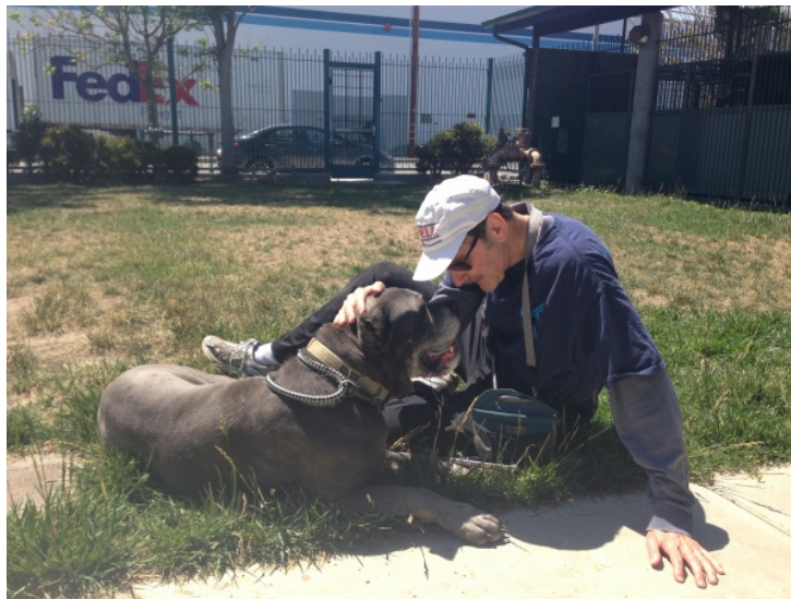
Cleo, killed for lack of space, 2015