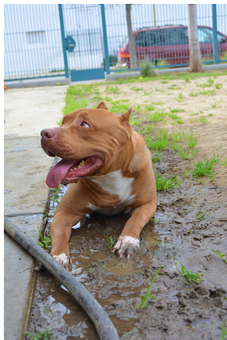
King, killed for lack of space, 2017