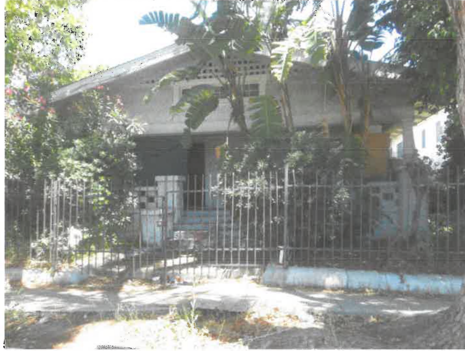
P5a. Photograph or Drawing (Photograph required for buildings, structures, and objects.)