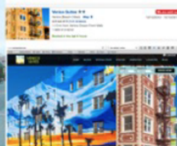
417 Ocean Front Walk- 32 unit RSO apartments

Carl Lambert converted 5 Rent Stabilized apartment buildings in Venice with long-term tenants into de-facto hotels.