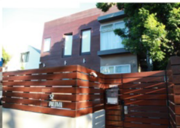
52 Paloma- 8 units RSO apartment- Mr Lambert recently sold this building but operated previously Paloma Suites.