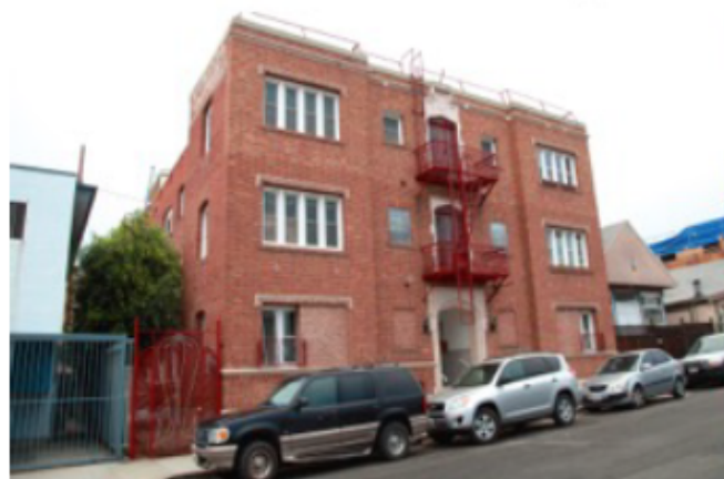
25 unit RSO apartments- Mr Lambert sold this building recently but operated previously as Venice Admiralty Suites