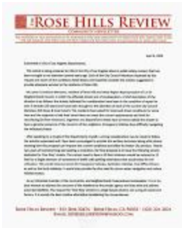
ROSE HILLS REVIEW - STREETS 2009.jpeg 839K