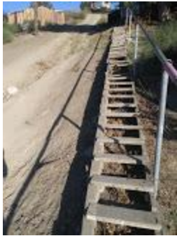
TELLURIDE STAIRWAY 1.jpg 103K