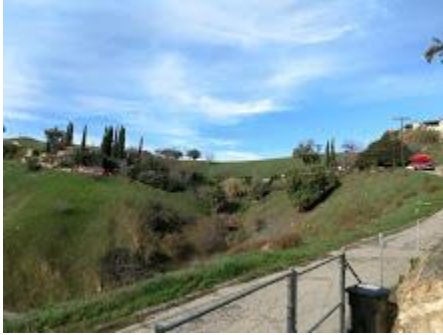
LAFD ENGINE TRUCK STUCK ON PARADISE.jpg 74K