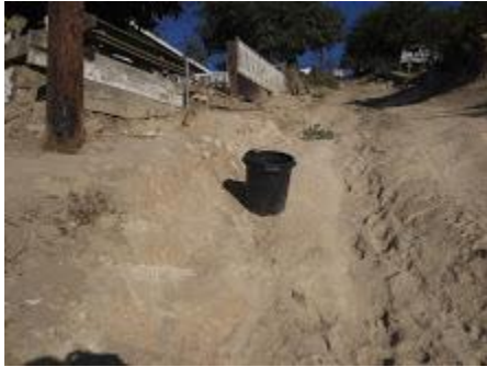
TELLURIDE BUCKET - DEEP.jpg 81K