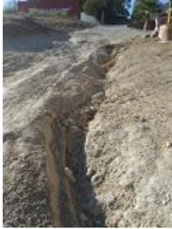
TOURMALINE DITCH.jpg 134K