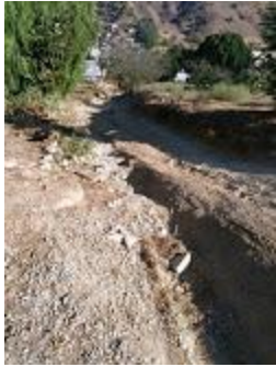
TOURMALINE 2.jpeg 594K