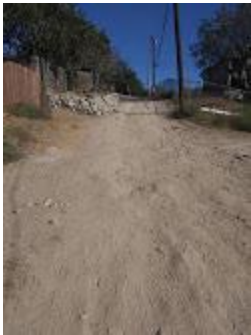
TURQUIOSE DIRT.jpg 89K