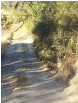
CATO TERRIBLE.jpg 126K