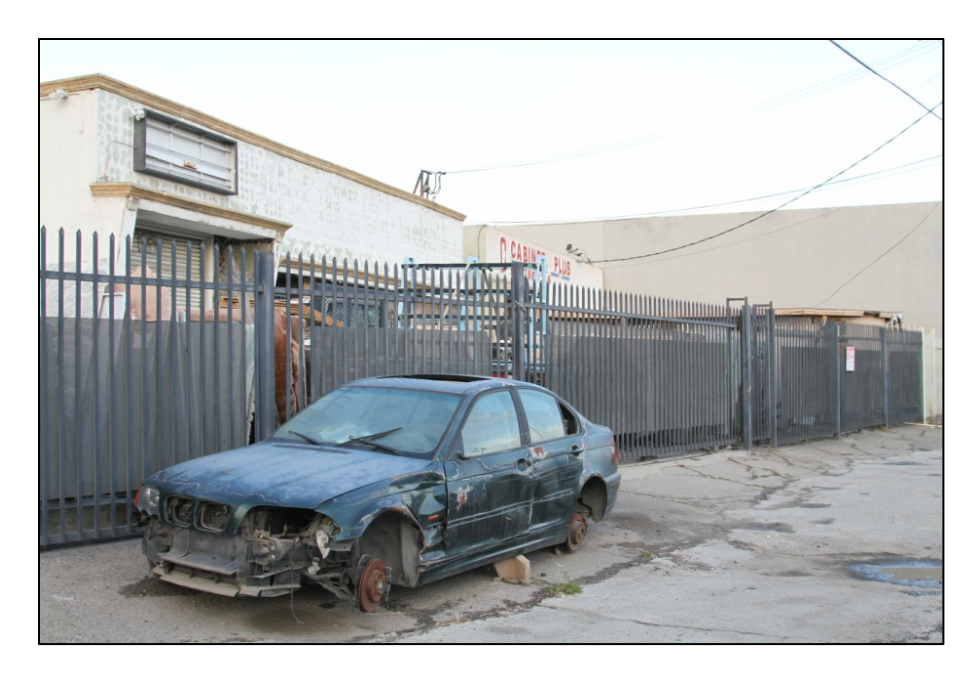
Figure 6. Same vehicle shown in Figure 4 without front license plate at 8500 (block) Tujunga Avenue, Sun Valley, on May 22, 2019. Unknown if the area the car sits on is considered private property as vehicle has remained in place since April 2019 at least.