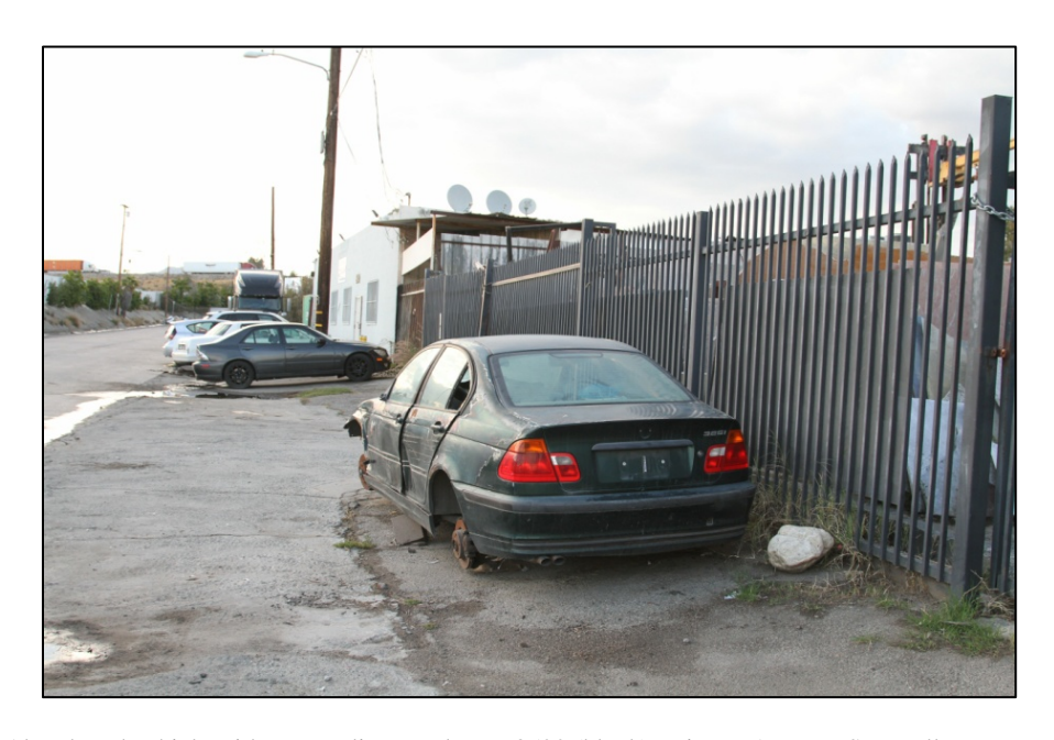
Figure 5. Abandoned vehicle without rear license plate at 8500 (block) Tujunga Avenue, Sun Valley, on May 22, 2019. Unknown if the area the car sits on is considered private property as vehicle has remained in place since April 2019 at least.