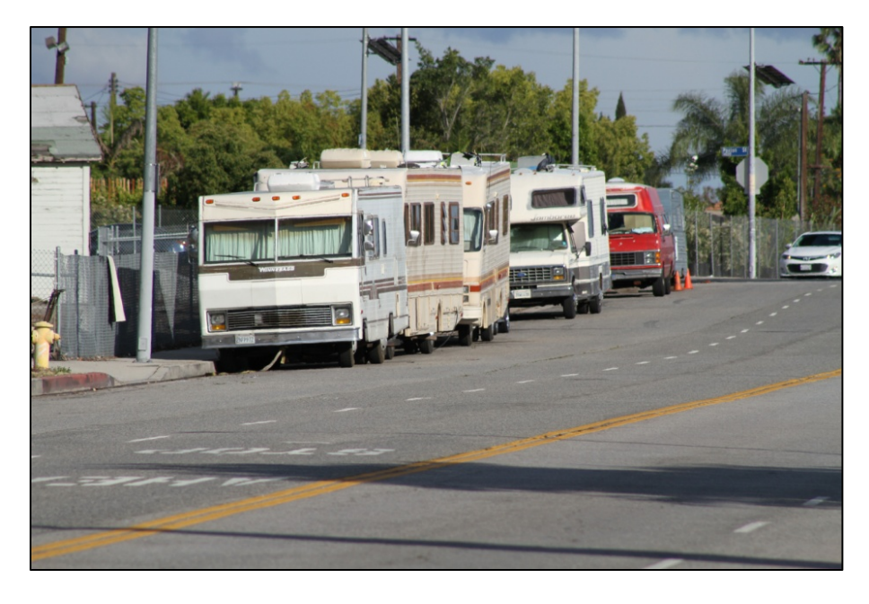
Figure 7. Recreational vehicles parked for more than 72 hours on northbound Arleta Avenue north of Paxton Street by Los Angeles County Flood Control Pacoima Wash in Mission Hills on May 22, 2019