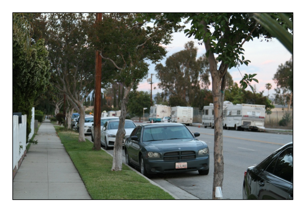
Figure 10. Same recreational vehicles shown in Figure 8 across from 14800 (block) Lassen Street, Mission Hills, on May 22, 2019. Front yard fencing and foliage from single-family homes is visible in this photograph.