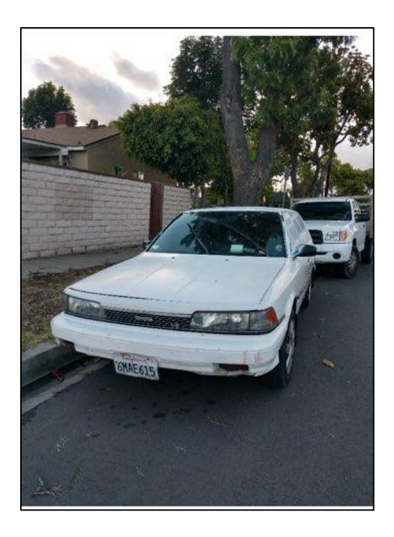
Figure 4. Stolen vehicle abandoned on Dorrington Street side of 14200 (block) Remington Street, Arleta, on May 22, 2019.