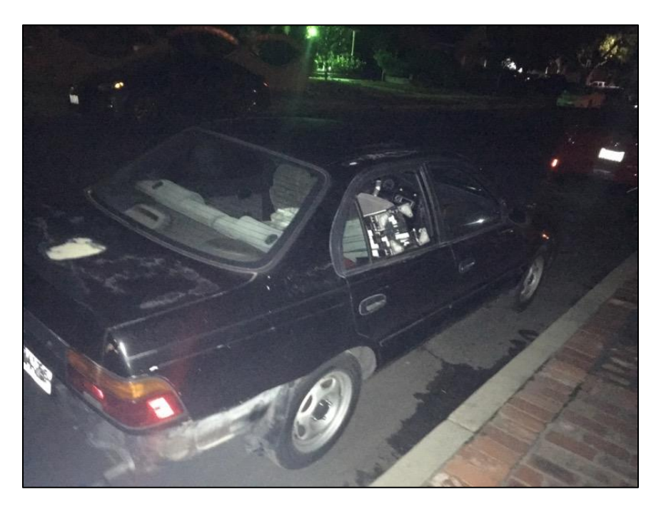
Figure 3. Stolen vehicle abandoned in front of 14200 (block) of Remington Street, Arleta, on May 22, 2019.