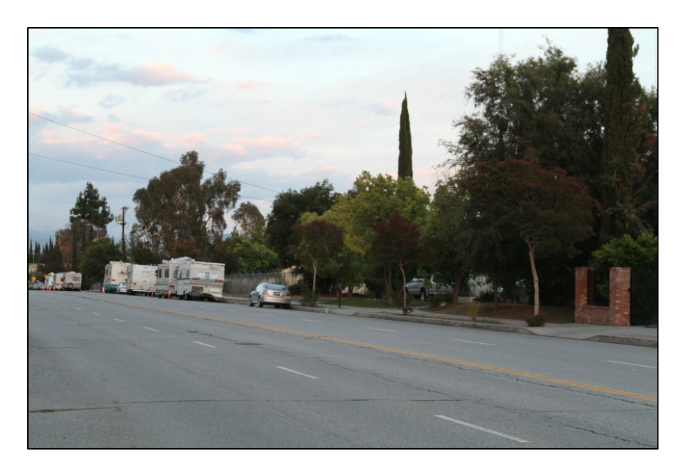
Figure 9. Recreational vehicles that have not moved their vehicles after well over 72 hours at 14800 (block) Lassen Street, North Hills, adjacent to and across the street from single-family homes on May 22, 2019. Moreover, vehicle dwelling here continues to go unfettered between 9 PM and 6 AM despite it being a yellow zone as shown in the mapped area shown in Figure 2.