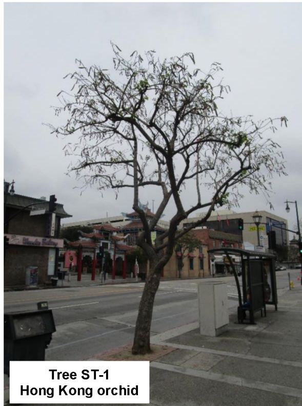
Tree ST-1 Hong Kong orchid