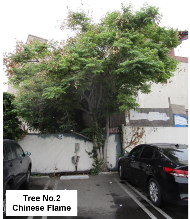
Tree No.2 Chinese Flame