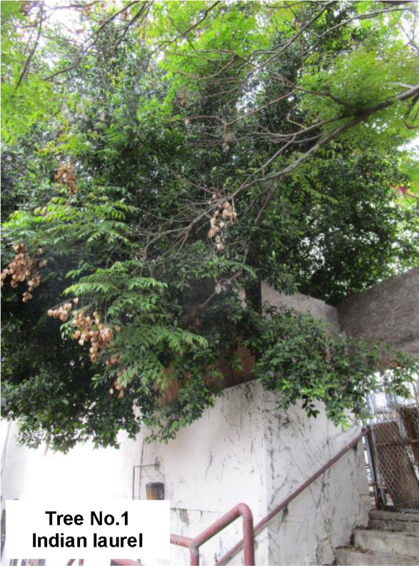
Tree No.1 Indian laurel