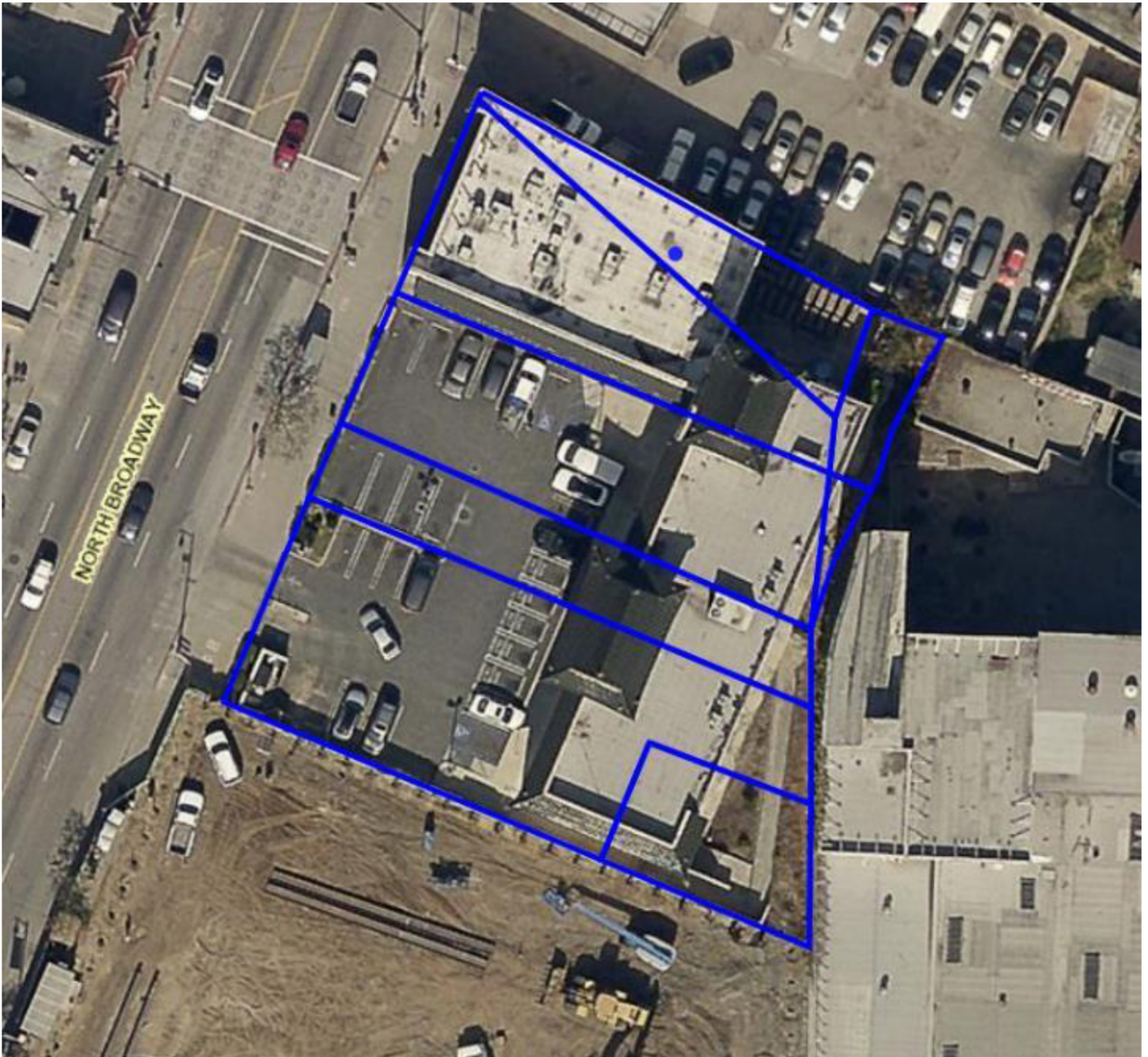
Aerial image of subject properties at 942 N. Broadway, Los Angeles