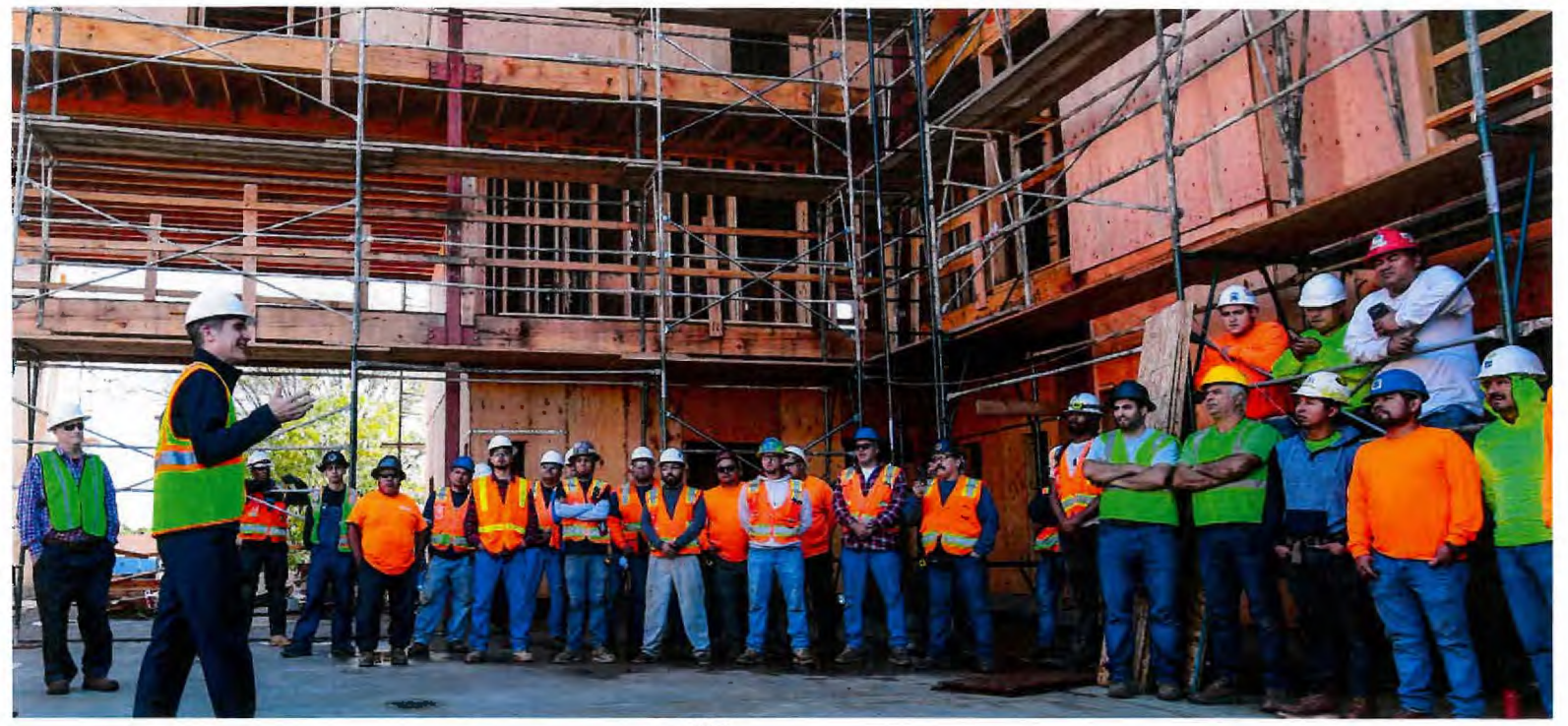
Mayor Garcetti speaks to a construction crew building 88th & Vermont, a supportive housing project funded with Prop HHH.