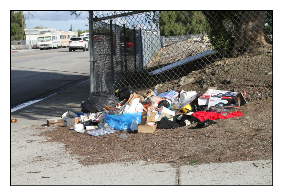
Figure 8. Trash left by unknown vehicle dweller on west side of Arleta Avenue at entrance to Pacoima Spreading Grounds in Mission Hills with same recreational vehicles shown in Figure 7 visible in the distance across the street on May 22, 2019. While not visible here this spreading grounds entrance is immediately adjacent to a single-family home.