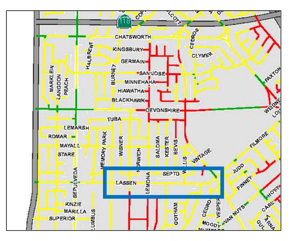
Figure 2. Clip of yellow zone vicinity of crash location in map of Mission Area Community Police Station regarding vehicle dwelling. Los Angeles Municipal Code 85.02 prohibits vehicle dwelling in yellow zones between 9:00 PM - 6:00 AM.