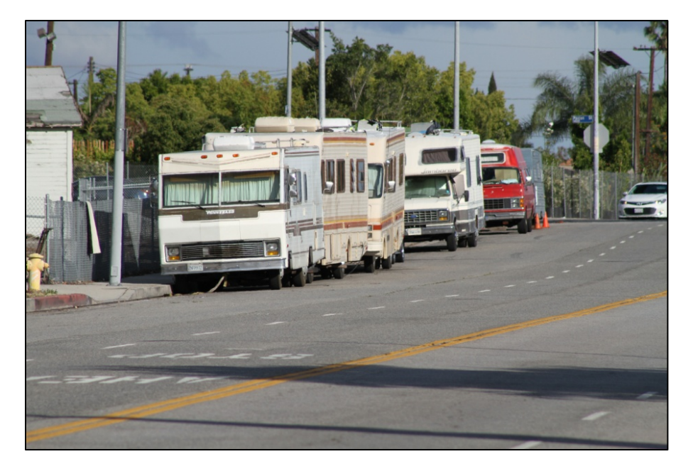
Figure 7. Recreational vehicles parked for more than 72 hours on northbound Arleta Avenue north of Paxton Street by Los Angeles County Flood Control Pacoima Wash in Mission Hills on May 22, 2019