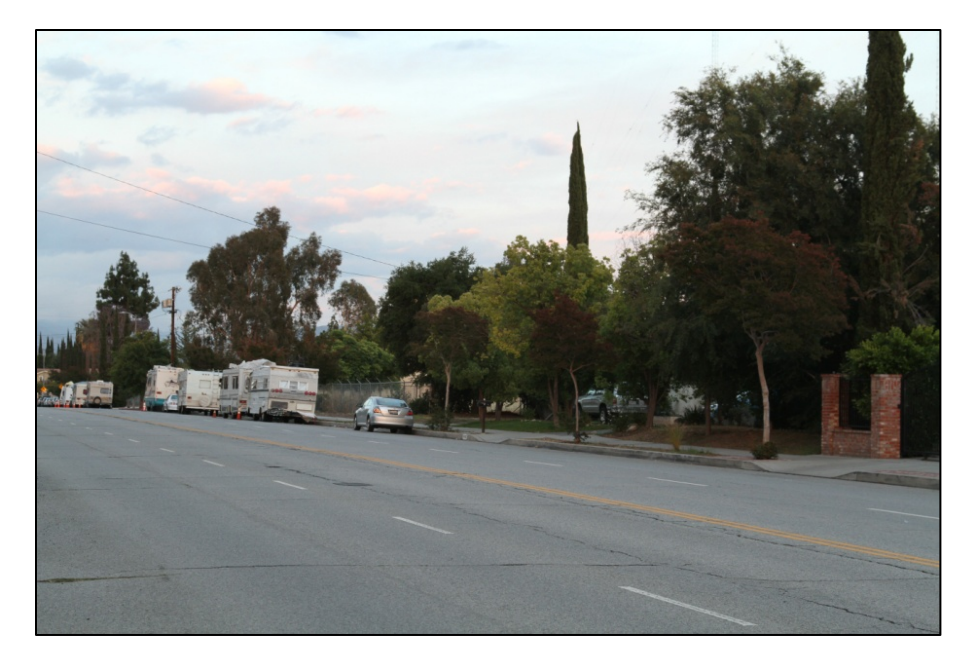
Figure 9. Recreational vehicles that have not moved their vehicles after well over 72 hours at 14800 (block) Lassen Street, North Hills, adjacent to and across the street from single-family homes on May 22, 2019. Moreover, vehicle dwelling here continues to go unfettered between 9 PM and 6 AM despite it being a yellow zone as shown in the mapped area shown in Figure 2.