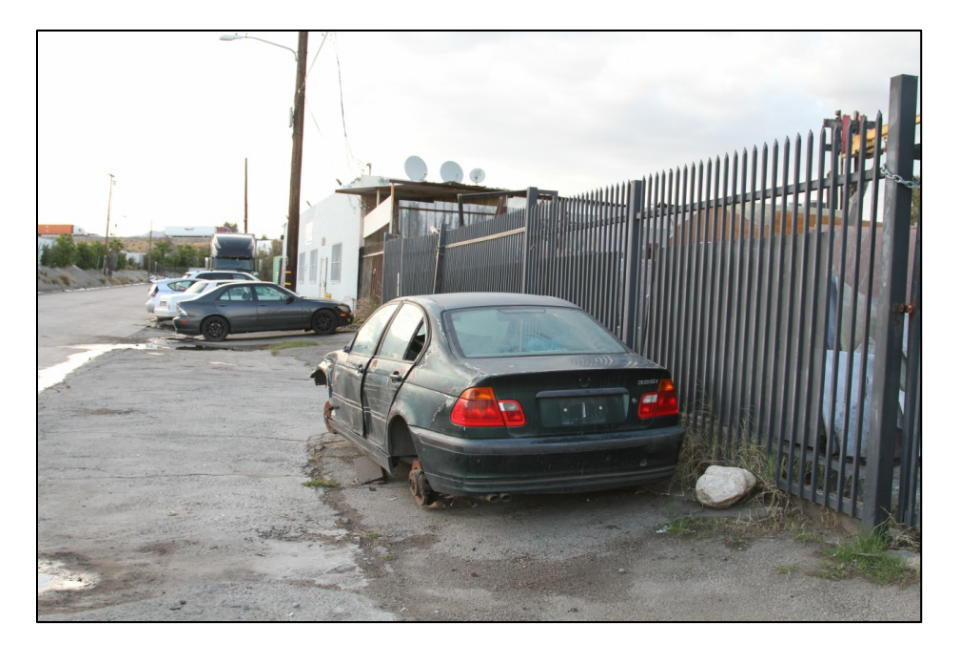
Figure 5. Abandoned vehicle without rear license plate at 8500 (block) Tujunga Avenue, Sun Valley, on May 22, 2019. Unknown if the area the car sits on is considered private property as vehicle has remained in place since April 2019 at least.

Figure 4. Stolen vehicle abandoned on Dorrington Street side of 14200 (block) Remington Street, Arleta, on May 22, 2019.