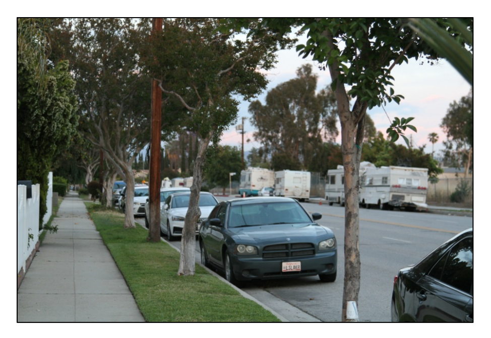
Figure 10. Same recreational vehicles shown in Figure 8 across from 14800 (block) Lassen Street, Mission Hills, on May 22, 2019. Front yard fencing and foliage from single-family homes is visible in this photograph.