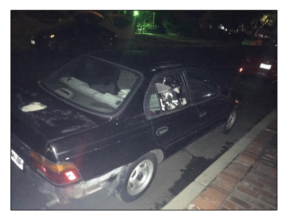
Figure 3. Stolen vehicle abandoned in front of 14200 (block) of Remington Street, Arleta, on May 22, 2019.