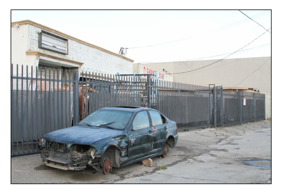
Figure 6. Same vehicle shown in Figure 4 without front license plate at 8500 (block) Tujunga Avenue, Sun Valley, on May 22, 2019. Unknown if the area the car sits on is considered private property as vehicle has remained in place since April 2019 at least.