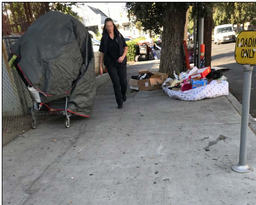
Figure 11. Homeless encampment belongings on same sidewalk shown in Figure 10 in the vicinity of Van Nuys Elementary. Location at 14401 Victory Blvd, Van Nuys. October 10, 2019