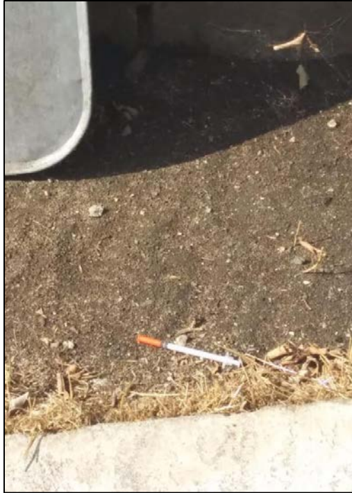
Figure 4. Hypodermic needle found in the vicinity of Canterbury Avenue and Pierce St in Arleta.