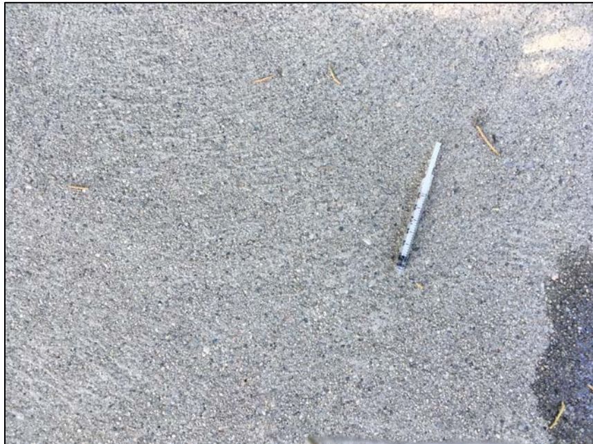
Figure 3. Hypodermic needle found in vicinity of Canterbury Avenue and Remington St in Arleta.