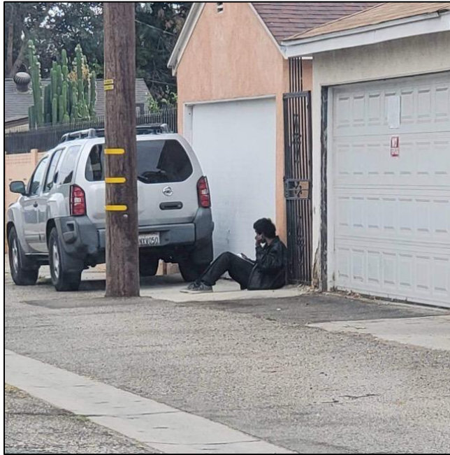
Figure 14. Homeless drug addict behind single-family residences in alley in the 9400 block of Dorrington Avenue in Arleta.