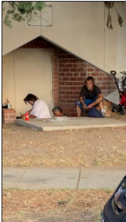
Figure 15. Homeless encampment at church side entrance/exit at Calvary Lutheran Church, 8800 Woodman Avenue, Arleta: Montague Street side. Child day care center on site.