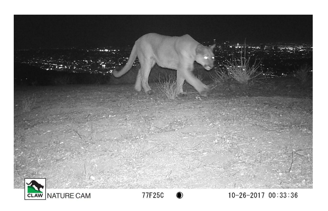
Surrounded by the 405 and 101 Freeways and traversing at least 8000 acres of wildlands abutting the backyards of communities like Bel Air, Beverly Hills, and Laurel Canyon, is another male mountain lion who has not yet been collared. Our CLAW nature cameras have captured him at home in the hills six times between 2017 and 2020.