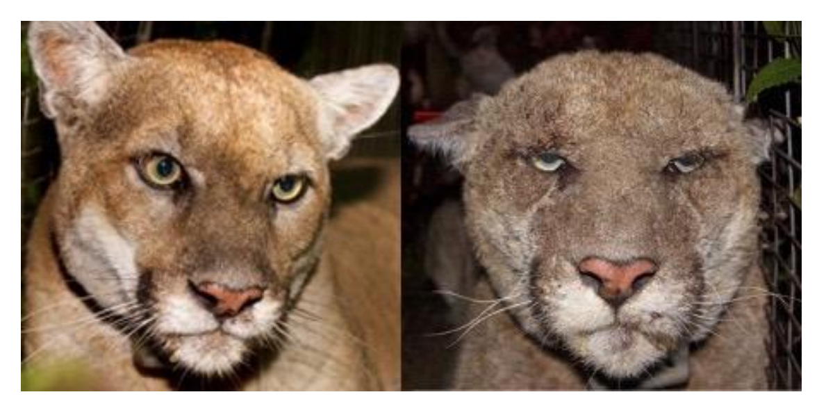
Hemmed in by the 101 and 5 Freeways, with only about 4000 acres of hills to traverse, the collared male mountain lion known as P-22 has gained acclaim for being the lone cougar in Griffith Park. Side by side images show a healthy P-22 alongside a P-22 sickened by rodenticide poisoning, highlighting the value of the tracking collar and ongoing study by the National Park Service (NPS).