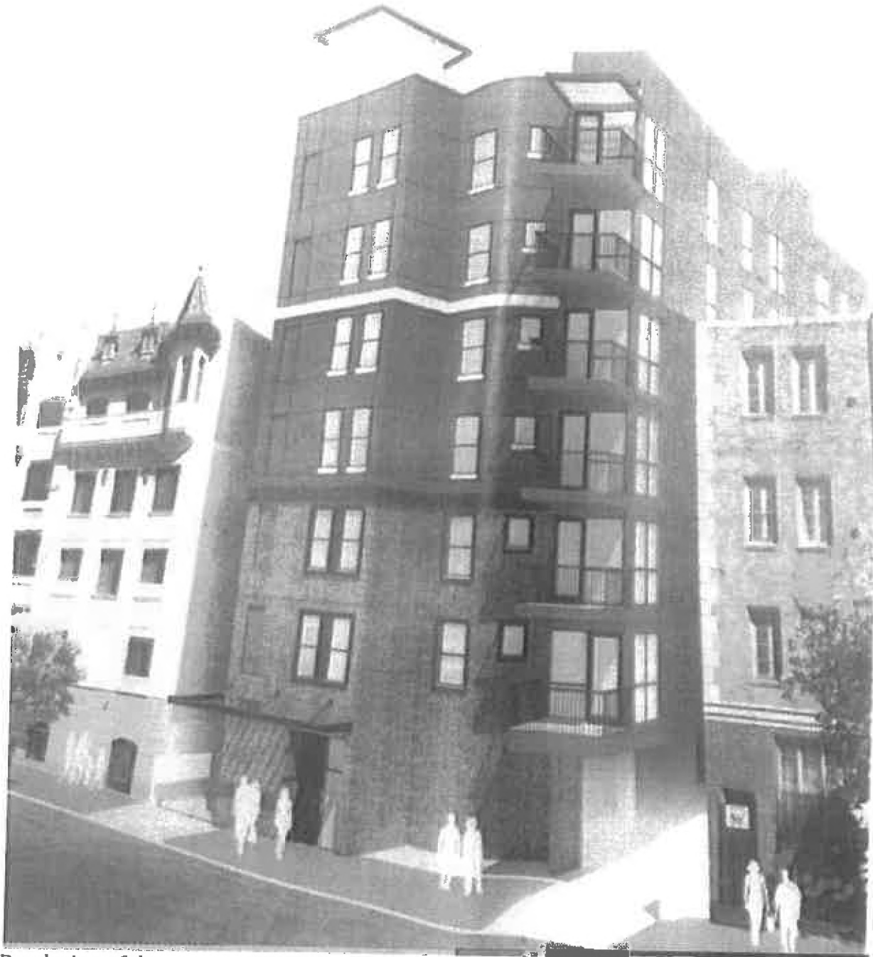
Rendering of the proposed project, showing its contemporary windows, modern balconies, and overwhelming height that are inconsistent with the character defining features of the District.