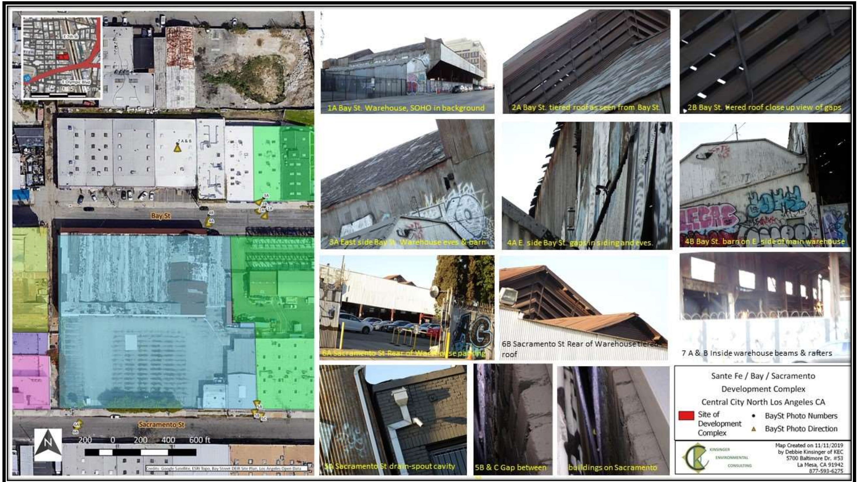
Figure 2 Location of Photo Points and Corresponding Photos