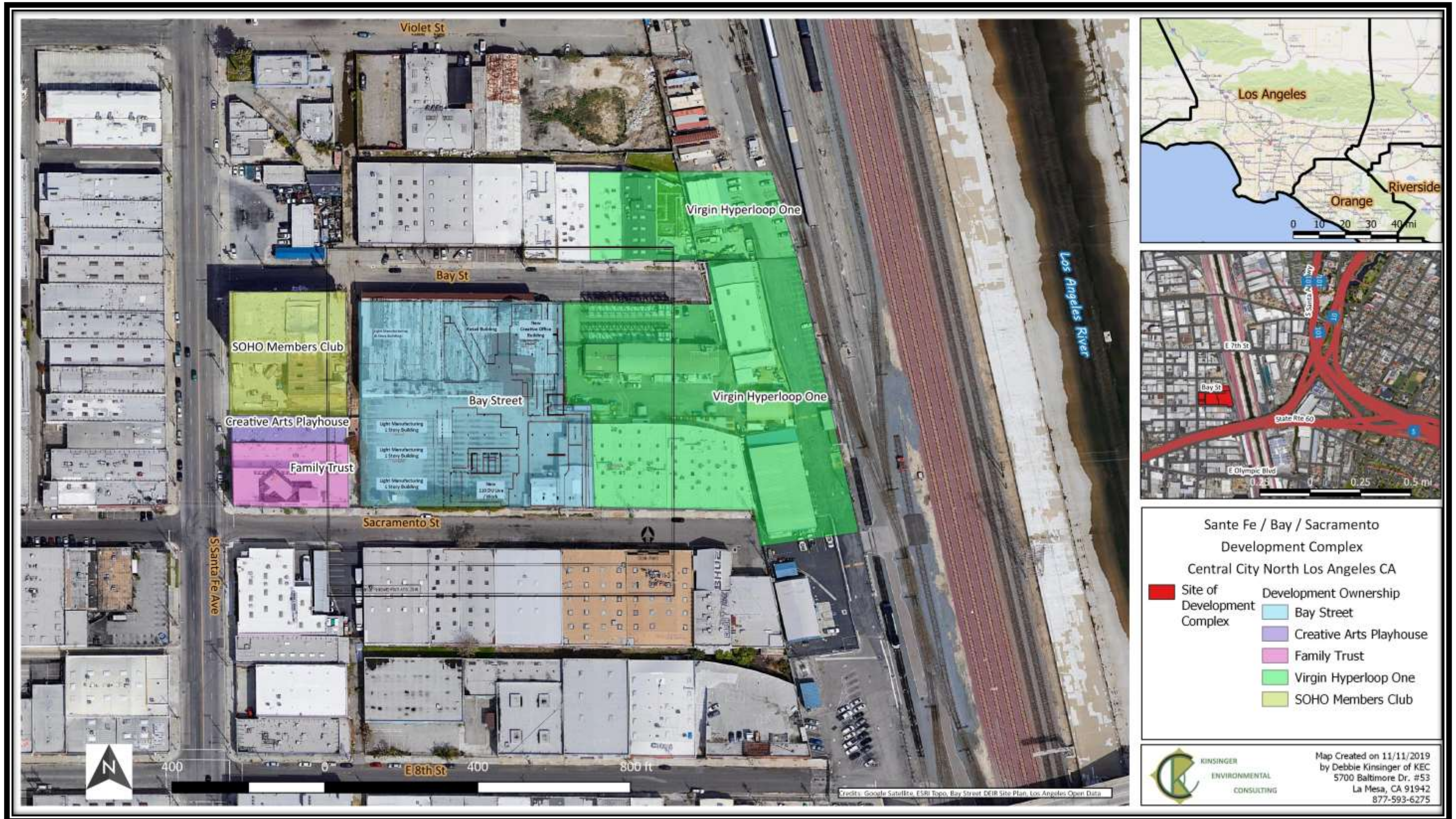
Figure 1 Bay Street Project Site Plan and Surrounding Planned Buildout, Location and Vicinity Map