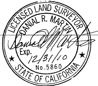
EXHIBIT "B": ATTACHED AND BY THIS REFERENCE MADE A PART HEREOF.

SUBJECT TO: ALL COVENANTS, RIGHTS, RIGHTS-OF-WAY AND EASEMENTS OF RECORD.