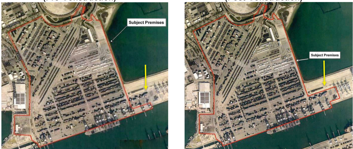
Figure 1: Fenix Marine Services, Ltd. Terminal at Berths 302-305 (Pre-Construction) (Post-Construction)

Note: Pictures are not to scale. Refer to Transmittals 1 and 3 in Attachment 1 for actual Figures.